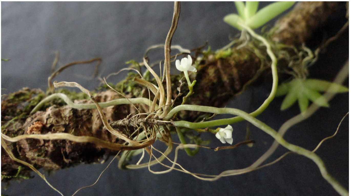
Fig. 1 Taeniophyllum wrightmyoensis Alappatt sp. nov., with Oberonia ensiformis (Sm.) Lindl. to the right.

Notes — Taeniophyllum wrightmyoensis can be best accommodated in subgenus ( Eu- ) Taeniophyllum and section Brachyanthera Schltr., because the sepals and petals are free, bracts distichous and anther with short beak. The new species resembles T. hasseltii (distributed in Peninsular Thailand, Peninsular Malaysia, Java to Christmas Islands) and T. pusillum (known from China to W. Malesia) in its habit, structure of sepals and petals and lip but differs from both in the features listed in Table 1. A comparison of the species with its other congeners in the islands is given in Table 2.