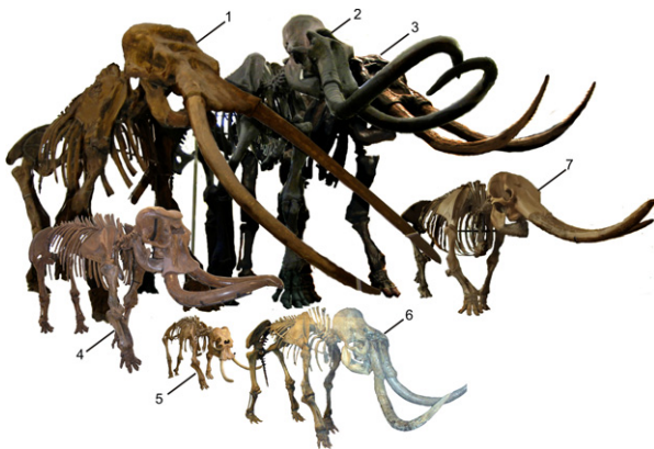
Figure 1 Reconstruction of four insular dwarf proboscideans with their respective mainland ancestors. Mainland proboscideans: 1, Palaeoloxodon antiquus ; 2, Mammuthus columbi ; 3, Stegodon zdanskyi . Insular proboscideans: 4, Palaeoloxodon 'mnaidriensis' ; 5, Palaeoloxodon falconeri ; 6, Mammuthus exilis ; 7, Stegodon aurorae . Based on skeletons at Museo di Paleontologia, University of Rome, Italy (1), American Museum of Natural History, New York (2), Taylor Made Fossils, U.S. (3), Museo di Paleontologia e Geologia G.G. Gemmellaro, Palermo, Italy (4), Forschungsinstitut und Naturmuseum Senckenberg, Frankfurt, Germany (5), Santa Barbara Museum of Natural History, Santa Barbara, U.S. (6), Taga Town Museum, Honshu, Japan (7).

Here, we expand the dataset for insular proboscideans as given in Lomolino et al. (2013) and further evaluate insular size trends of these very large insular mammals which are lacking in basically extant insular faunas. The dataset is limited to North America and Eurasia as no fossil proboscideans have been discovered from islands of Africa, South America or Antarctica.