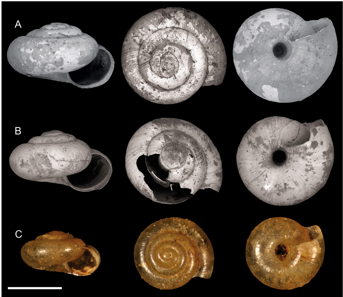
Figure 2. Species of Mayadiscops gen. nov., cont. A , Mayadiscops balboa (Pilsbry, 1930) comb. nov., lectotype ANSP151362 (shell width 2.0 mm). B , Mayadiscops opal (Pilsbry, 1920) comb. nov., lectotype ANSP48523 (shell width 1.9 mm). C , Mayadiscops ridiculus (Pilsbry, 1930) comb. nov., holotype ANSP150163 (shell width 1.44 mm). Scale bar = 1 mm.

Geographic range. Southern Mexico, along continental Central America (Belize, Nicaragua, Guatemala, Panama), to Colombia, Curaçao, and Venezuela.