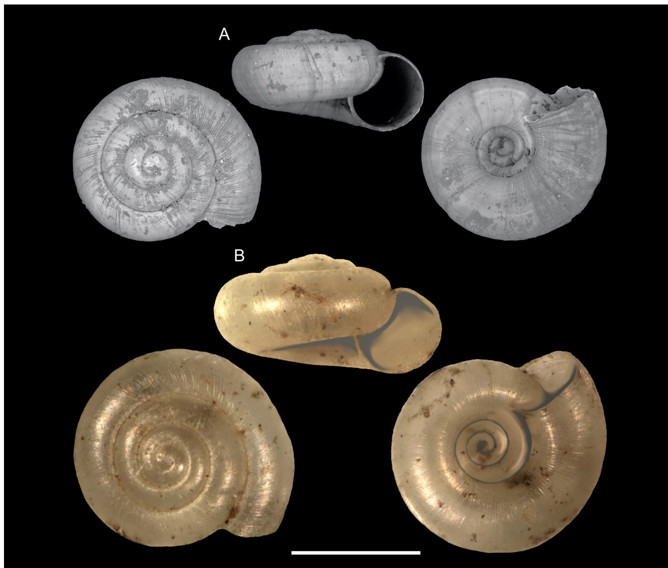
Figure 5. Species of Miradiscops , cont. A , Miradiscops puncticipitis (Pilsbry, 1926), holotype ANSP45656 (shell width = 1.5 mm). B , Miradiscops youngii D.S. Dourson, Caldwell & J.A. Dourson, 2018, holotype FLMNH-IZ-505451 (shell width c. 1.8 mm); image is a courtesy of Dan Dourson. Scale bar = 1 mm.

its protoconch (Thompson 1967: 241). The spiral rows of pits on the protoconch can seem like striae under insufficient magnification; likewise, such rows on the teleoconch can become invisible under the same circumstances (Ravalo et al. 2023). Indeed, Thompson (1967: 241) noted that there was “[n]o spiral sculpture present” on the teleoconch; thus, the allocation of this species in Miradiscops should be reassessed in the future through analysis of its type material.