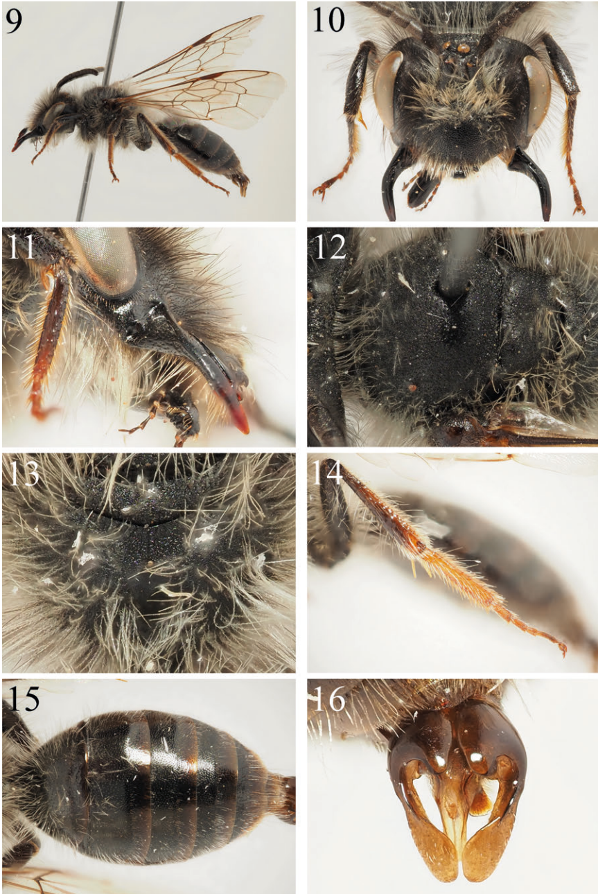
Figs 9-16: Andrena (Andrena) ladakha nov.sp. male. (9) Habitus, lateral view; (10) face, frontal view; (11) malar space, lateral view; (12) scutum, dorsal view; (13) propodeum, dorso-posterior view; (14) hind leg, lateral view; (15) terga, dorsal view; (16) genital capsule, dorsal view.