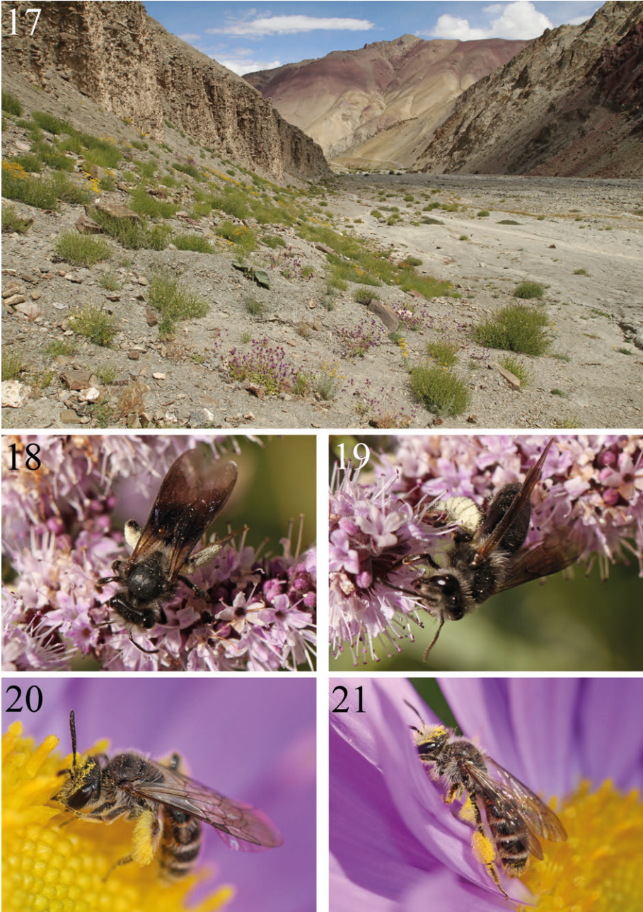
Figs 17-21: (17) Collecting site of Rumbak at 3850 m; (18-19) Andrena mordax MORAWITZ, 1876 female at Mentha flowers (Lamiaceae; photographs taken at Rumbak); (20-21) Andrena floridula SMITH, 1878 female at Asteraceae flowers (photographs taken in Leh gardens).