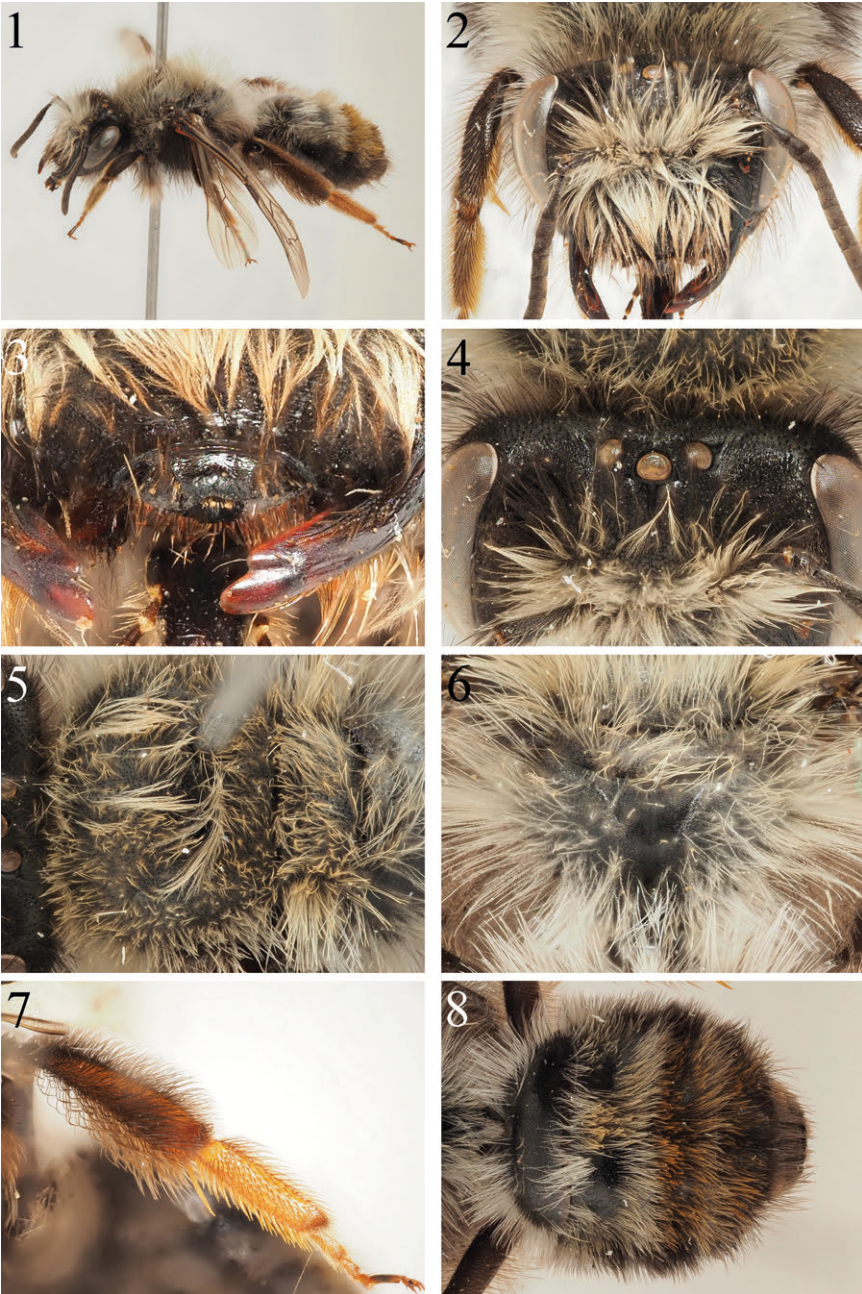
Figs 1-8: Andrena (Andrena) ladakha nov.sp. female. (1) Habitus, lateral view; (2) face, frontal view; (3) process of the labrum, ventral view; (4) head, dorsal view; (5) scutum, dorsal view; (6) propodeum, dorso-posterior view; (7) hind leg, lateral view; (8) terga, dorsal view.