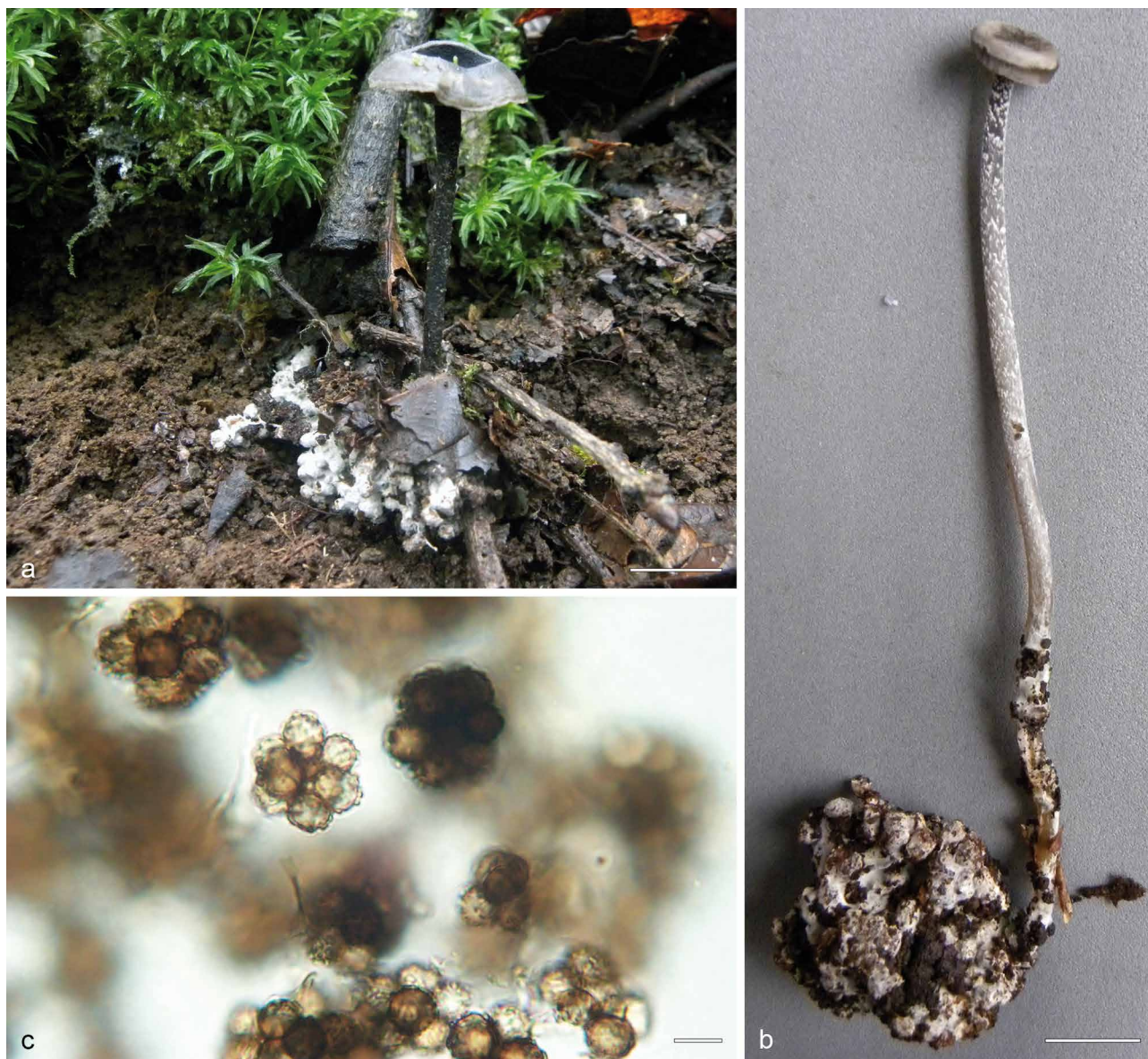
Fig. 1 Blastosporella zonata (TJB10425) a. Dark blastoconidia located at the centre of the pileus; b. excavated specimen showing the aggregated faecal pellet substrate (TJB10433); c. ornamented blastoconidia which cover the pileus (ZT6333). — Scale bars: a–b = 10 mm, c = 10 \mu m.

addition, the thick-walled conidia may also serve as a survival structure as an insect faecal substrate is most likely only seasonally available. A similar survival function has also been suggested for the conidia of the mycoparasitic genera Asterophora and Squamanita (Redhead et al. 1994).