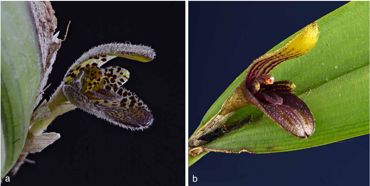
Fig. 2 Flower morphology of a. Echinosepala truncata ; b. E. tomentosa (from a. Álvarez 288, b. Bogarín 12945; all JBL).