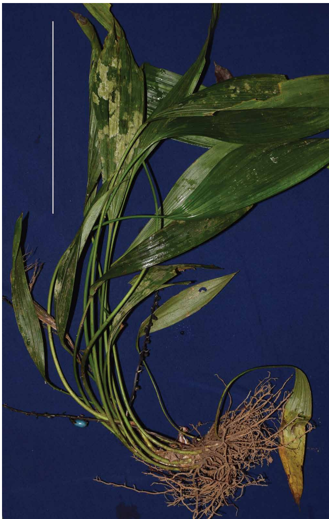
Fig. 3 Habit of Peliosanthes macrophylla var. assamensis N.Tanaka & D.Borah from Behali Reserve Forest, Assam, India. — Scale bar = 25 cm.