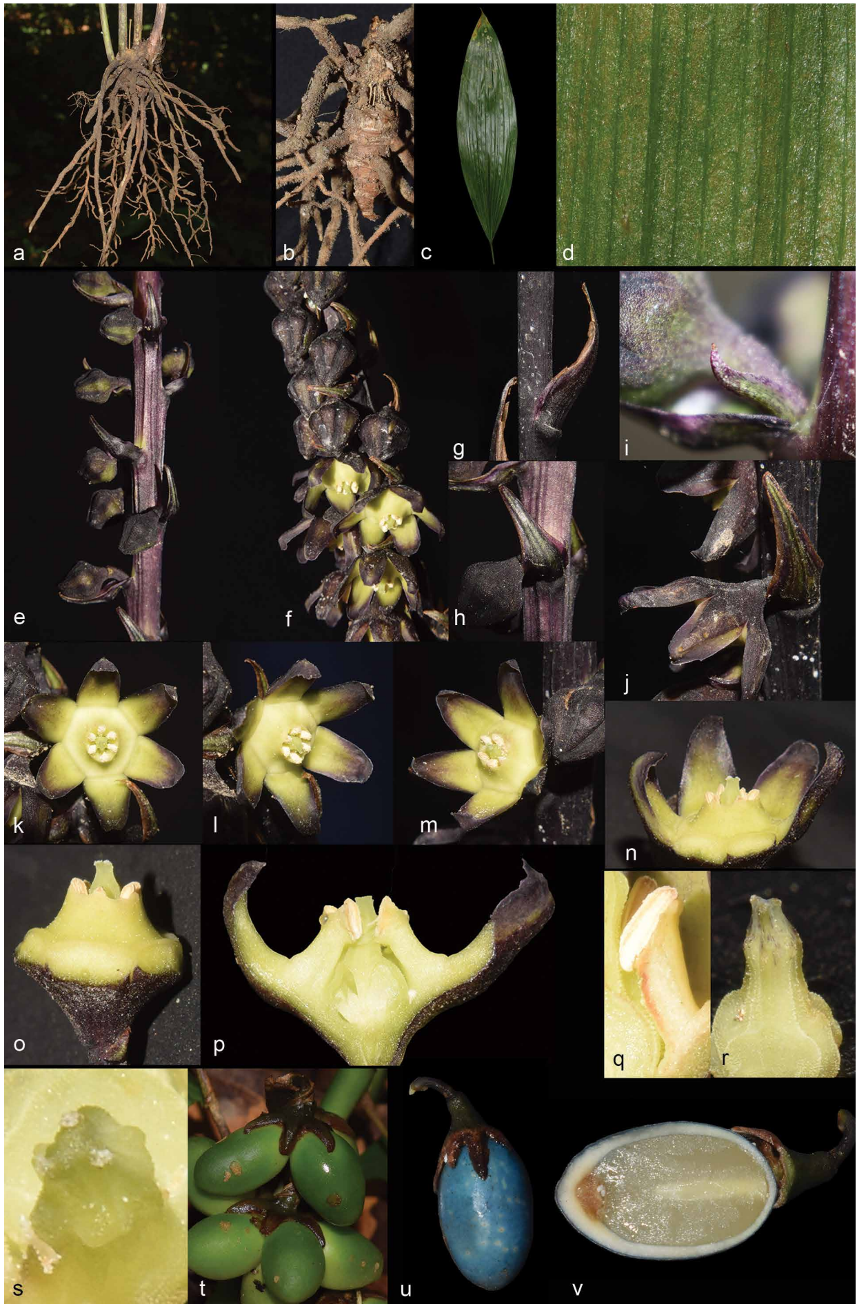
Fig. 2 Peliosanthes macrophylla var. assamensis N.Tanaka & D.Borah from Behali Reserve Forest, Assam, India. a–b. Rhizome; c–d. leaves; e–f. inflorescence; g. sterile bract; h. fertile bract; i. bracteole; j–m. flower; n. corona with two perianth segments removed; o. corona; p. longitudinal section showing the interior structure of the corona; q. stamen; r–s. pistil; t–v. fruit.