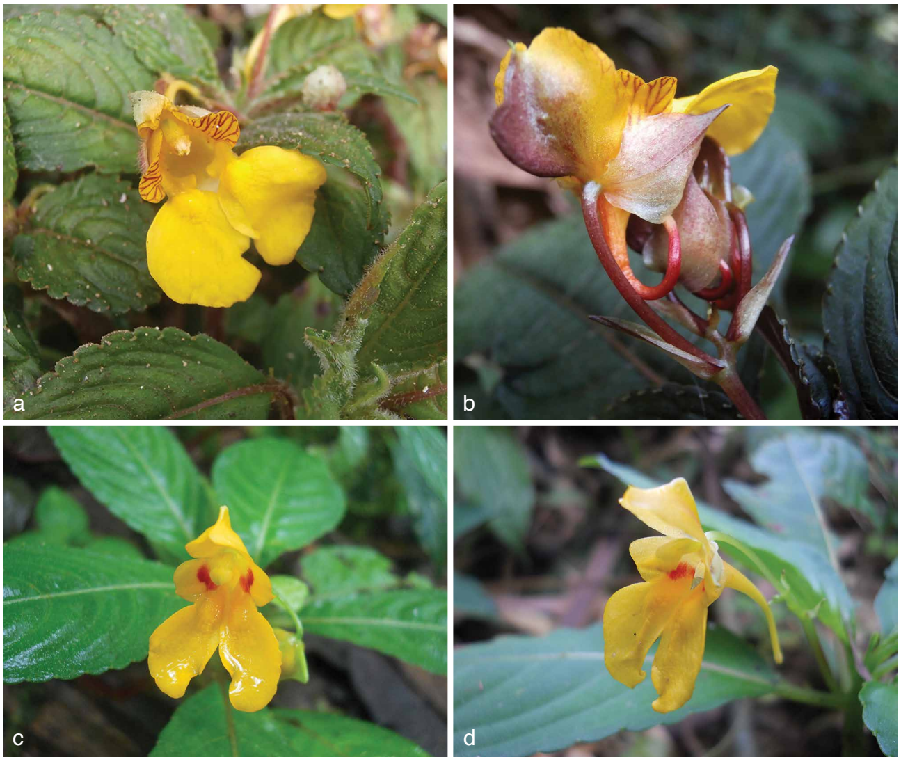
Fig. 1 a–b. Impatiens marroninus Utami; b. I. marroninus Utami with short curved spur. — c–d. Impatiens beccarii Hook.f. ex Dunn; d. I. beccarii Hook.f. ex Dunn with long filiform spur. — Photos by H. Wiriadinata.