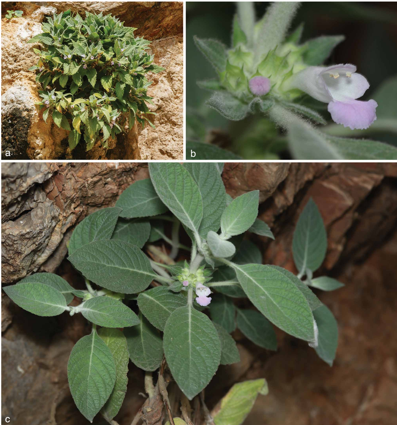
Fig. 1 Gomphostemma phetchaburiense Bongch. & Poopath. a. Habitat, showing plant growing outside the limestone karst with incised serrate leaf margins; b. cyme and lateral view of corolla; c. habitat, showing plant growing inside the limestone cave entrance with shallowly serrate leaf margins.

Perennial, ascending herbs, 30–50 cm tall. Stems stout, much-branched from a woody base, obtusely quadrangular, longitudinally grooved. Indumentum dense, hairs dendroid and stellate with multi-celled stalks. Leaves chartaceous, densely tomentose with stellate hairs; blades ovate or elliptic, 4–9 by 2.5–3.5(–4) cm, apex acute, base cuneate or sometimes oblique, margin shallowly serrate or incised serrate, lower side pale green; petioles 15–30 mm long. Inflorescence thyrsoid with sessile condensed opposite cymes forming verticillasters, lax with adjacent nodes, 20–40 mm apart, becoming condensed above; cymes 5–7-flowered; bracts subtending cymes leaf-like; outer bracteoles sessile, lanceolate or elliptic, 15–20 by 3–7 mm, with dense dendroid hairs on both sides; inner bracteoles narrowly lanceolate or elliptic-lanceolate, 5–10 mm long, with dense dendroid hairs on both sides. Flowering calyx pale green, infundibular, 8–11 mm long; tube 5–7 mm long, outside