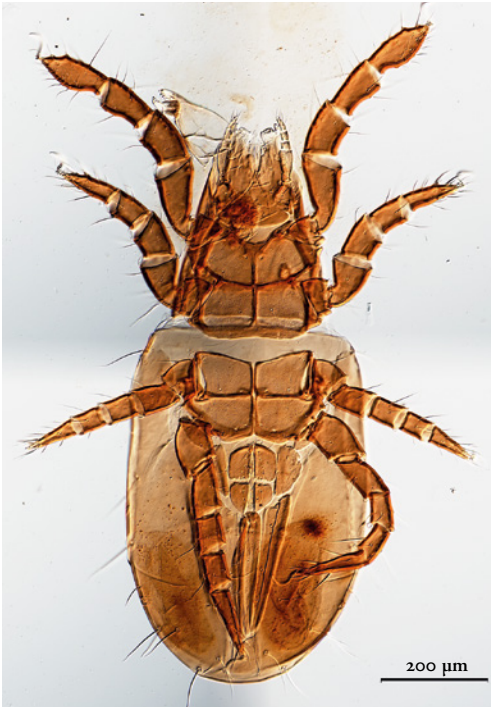
Figure 5. Perlohmannia dissimilis .