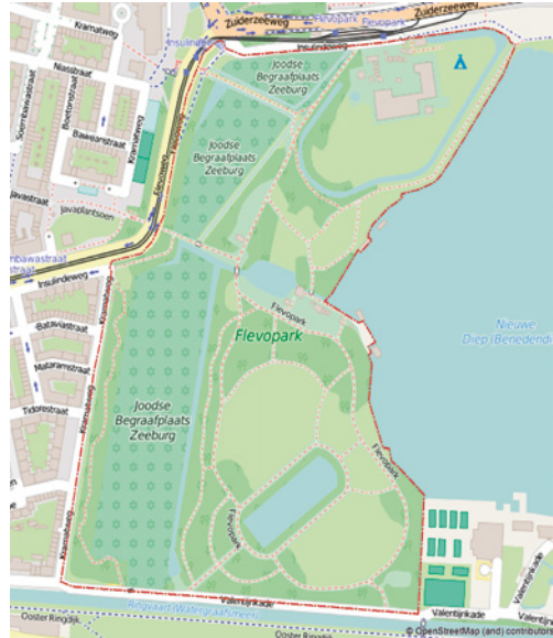
Figure 3. Location of the Flevopark. Illustration Ozan Arif Kesik. Figuur 3. Locatie van het Flevopark. Illustratie Ozan Arif Kesik.