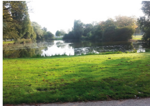
Figure 4. Flevopark, habitat of the two newly recorded mite species. Figuur 4. Flevopark, leefgebied van de twee nieuwe mijten.

and sharply developed tip; the setae le inserted away from the end of the tip. The morphology of the juvenile was studied by Ermilov (2012).