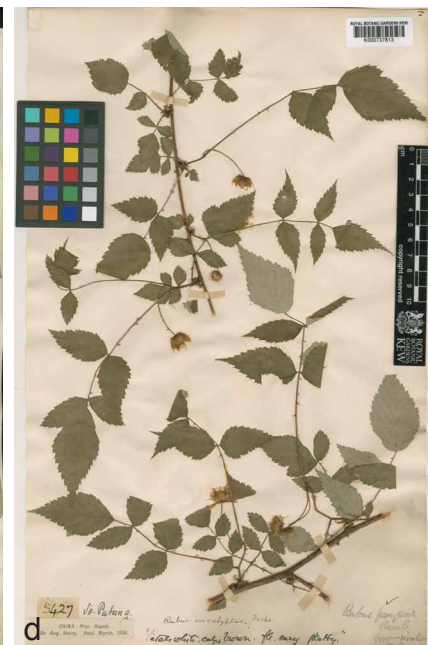
Fig. 2 a. Field photograph of Rubus lasiostylus Focke var. lasiostylus ; b. lectotype image of Rubus lasiostylus Focke var. lasiostylus (K); c. lectotype image of Rubus lasiostylus Focke forma glabratus Focke (GH); d. lectotype image of Rubus eucalyptus Focke (K).