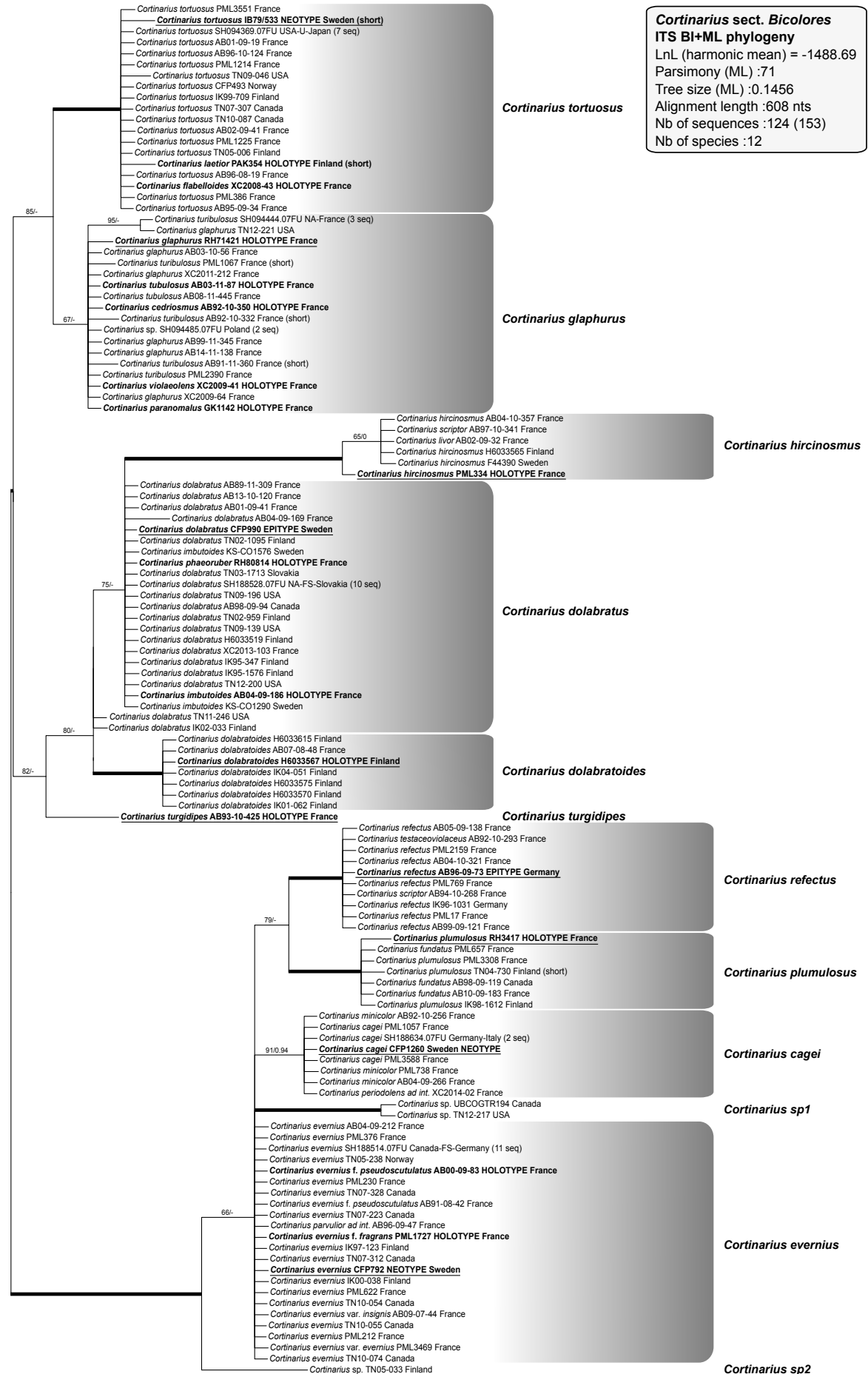
Fig. 2 The morphogenetic Bicolores section. — Bayesian 50 % majority-rule consensus tree inferred from the analysis of the ITS sequence of 124 (153 represented, due to Species Hypotheses, see Material and Methods) Telamonia sequences nested in Bicolores . Branches with strong statistical support (BPP \geq 95% and SH-aLRT > 0.8) are highlighted as thick lines, others display support values as % BPP/SH-aLRT. Sequences from 'type' material are highlighted in bold , those having nomenclatural priority are further underlined.