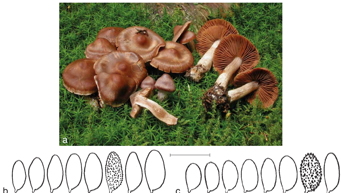
Fig. 4 Cortinarius dolabratooides sp. nov. — a. In situ photograph of the French collection A. Bidaud 07-08-48; b. sporogram of the holotype collection H:6033567; c. sporogram of the C. dolabratus collection T. Niskanen 02-959 (for comparison purposes). — Scale bars: a = 5 cm; b–c = 10 µm.

Notes — Morphologically, C. dolabratooides is reminiscent of its sister phylogenetic species C. dolabratus . Fortunately, the two species can be distinguished microscopically, C. dolabratooides delivering the narrowest spores in the section (width = 3.5–4.6–5.0 µm, Av Q = 1.82, Table 3). By comparison, the spores of C. dolabratus are distinctly wider (width = 4.4–4.9–5.5 µm, Av Q = 1.76, Table 3) and strongly verrucose throughout (Fig. 4b–c). Finnish collections consistently smelled of cedar wood, but this criterion, as a diagnostic feature, may be used with caution since the French material displayed only a weak grass-like odour. At the molecular level, C. dolabratooides differs from C. dolabratus by 3 substitutions only, but is not polymorphic at the ITS locus across its pan-European distribution range, making it well resolved within sect. Bicolores (Fig. 2, Table 3).