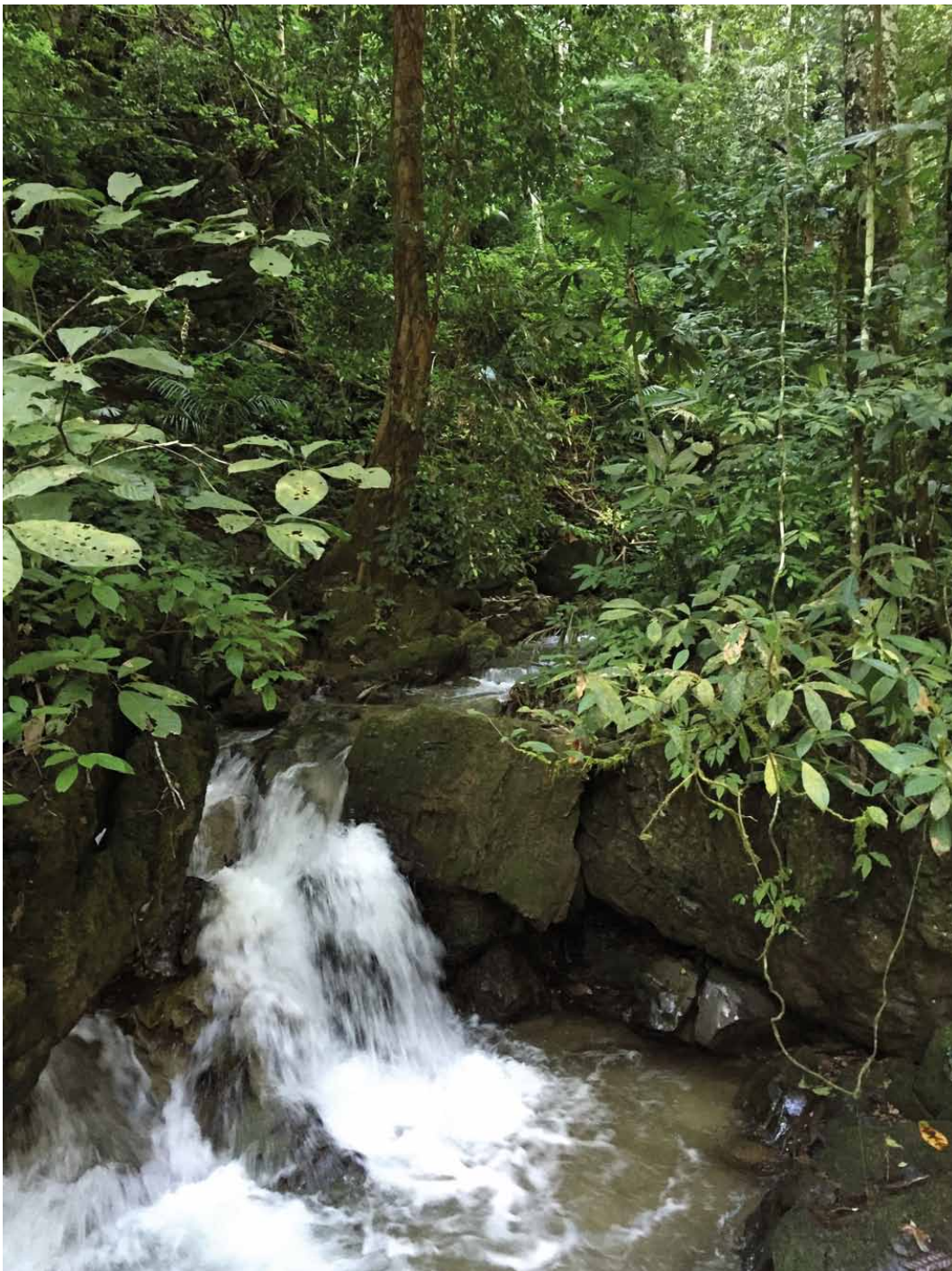
Fig. 3 Primary, moist evergreen forest at the type locality in Kasi District, Vientiane Province, northwest Laos.

of the floral bract, up to 2.0 mm long; ovary narrowly conical, 4.9–5.2 mm long, c. 2.5 mm diam, olive green with irregular purple blotches; sepals and petals similar, outer surfaces cream-beige with irregular pink-violet flecks, glossy white inside, narrowly elliptic-lanceolate, acuminate; dorsal sepal 22.4–26.8 mm long, 3.5–4.2 mm wide, 5-veined; lateral sepals slightly oblique, slightly inflated and slightly saccate at base, 21.8–24.6 mm long, 2.8–3.5 mm wide, 3-veined; petals slightly oblique, 21.0–23.5 mm long, 1.8–2.8 mm wide, 3-veined; labellum white with irregular pink-violet flecks and blotches, not spurred but slightly concave at base, narrowly obovate-spathulate, 20.7–21.5 mm long, divided above the middle by a narrow waist into a hypochile and epichile; hypochile oblong, 11.2–12.0 mm long, 3.5–4.2 mm wide, lateral margins raised and embracing the column, terminating in a pair of short, ovate, obtuse auricles up to 0.4 mm long; epichile ovate-orbicular, 9.5–9.8 mm long, 5.9–6.4 mm wide, apex acute; disk bearing a central lanate