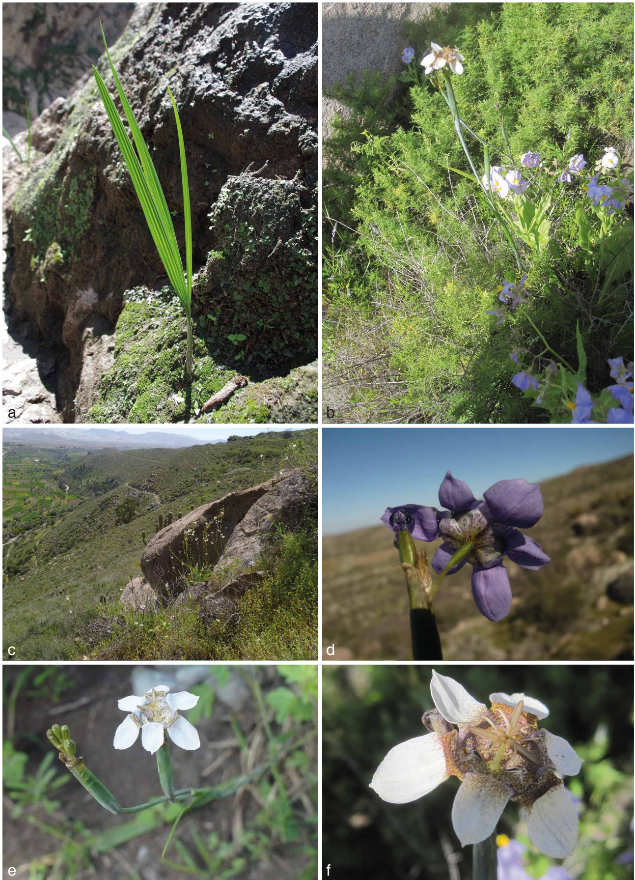
Fig. 1 Tigridia arequipensis Montesinos, Pauca & I.Revilla. a. Young plant in occasional humid soils near the waterfalls of Sogay, Quequeña district at 2914 m; b. mature plant in a xeric scrubland habitat, Cerro Llorón, Socabaya district at 2490 m; c. xeric scrubland habitat in Quequeña district at 2700 m; d. flower opening at Misti volcano lower slopes, Alto Selva Alegre District, 2800 m; e. flower and fruits at Sogay, Quequeña district at 2914 m; f. mature flower in Cerro Llorón, Socabaya district at 2490 m.