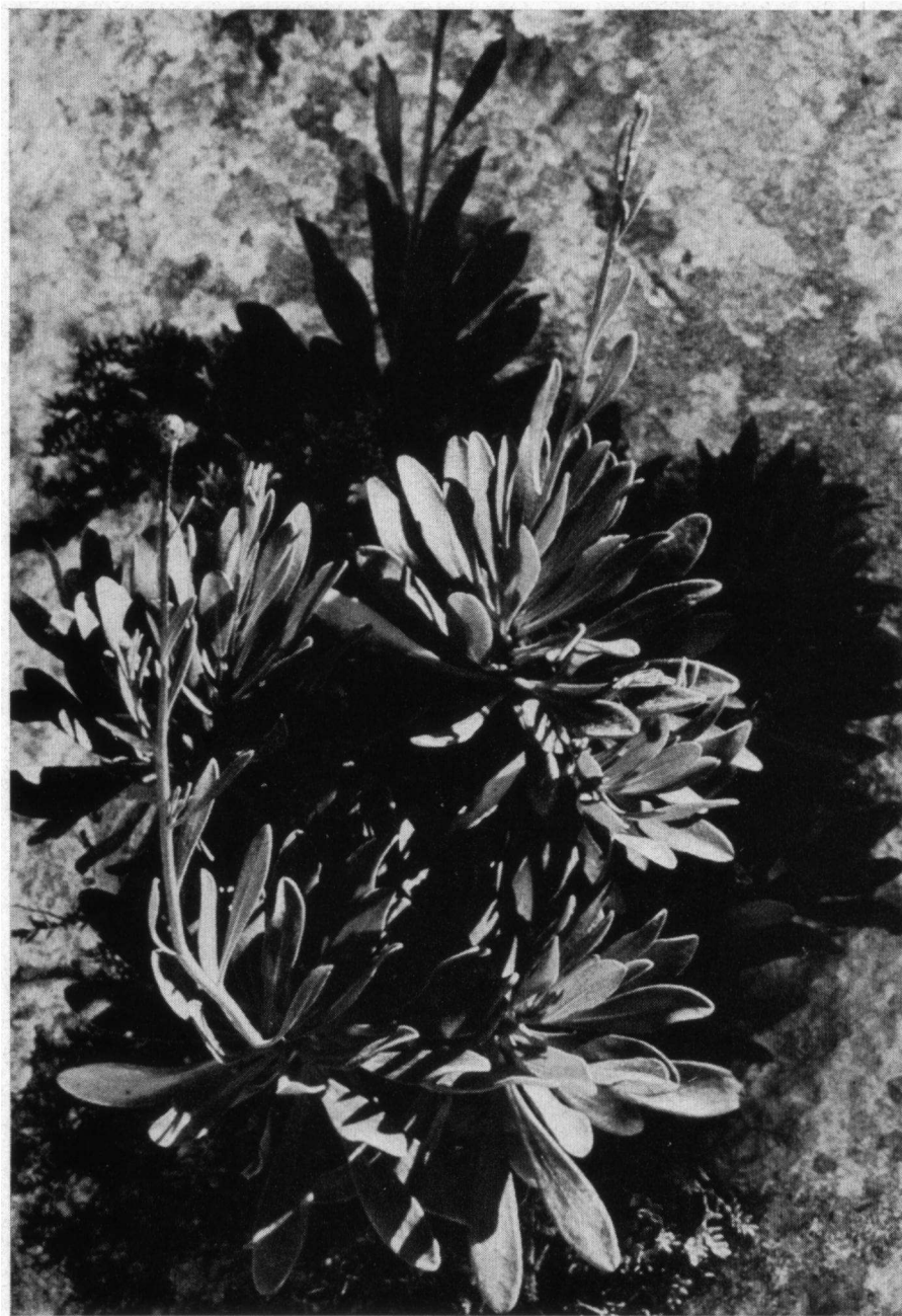
Fig. 1. Centaurea crassifolia . Wied Babu, Malta.