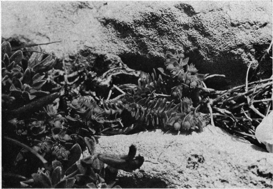
Fig. 4. Euphorbia exigua var. pycnophylla at the type locality, Wied il-Ghasri, Gozo (photogr. by L. Y. Th. Westra).

once found it in Elba in a small patch of undisturbed grassland (3391, near Procchio).