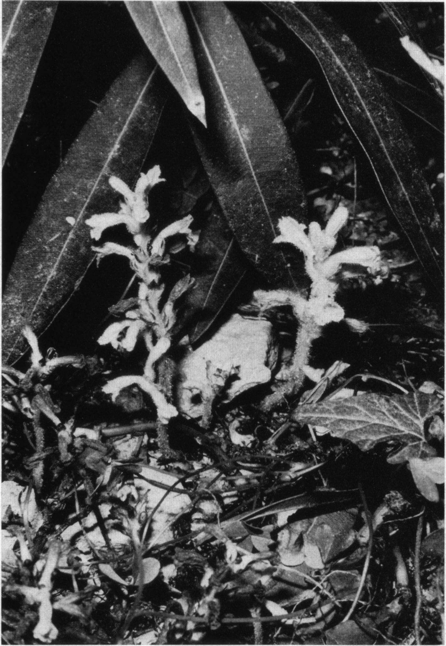
Fig. 5. Orobanche nana f. melitensis . Mellieha, Malta.