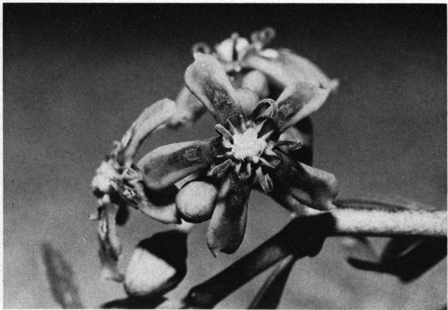
Fig. 3. Periploca angustifolia. Rdum il-Qammieh, Malta (photogr. by L. Y. Th. Westra).

M: Rdum il-Qammieh, edge of Marfa Ridge, 4288 ( fig. 3 ); G: Mgarr, 4367. Called P. laevigata Aiton in the two older floras, but according to BROWICZ in his monograph of the genus (1966) that species is restricted to Macaronesia. P. angustifolia occurs in North Africa and Syria and just barely reaches southern Europe.