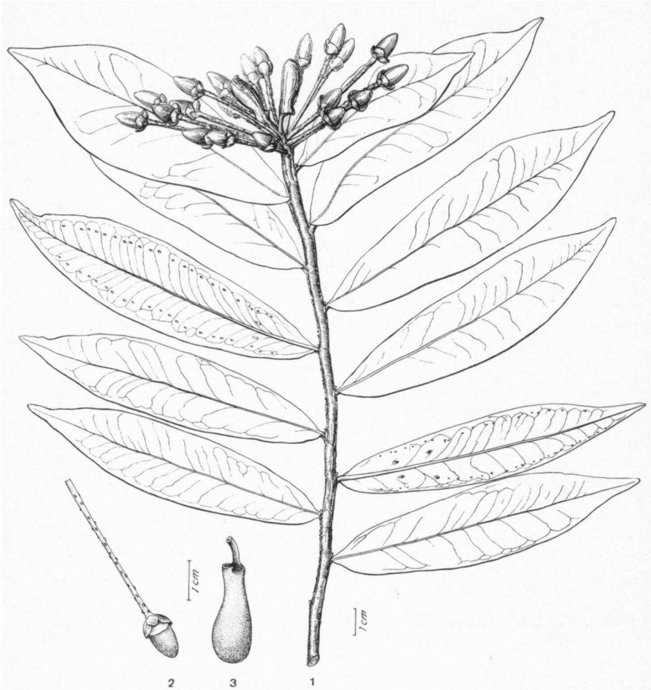
Plate 3. Marcgravia patellulifera , habit, flower and nectary. Fig. 1 after Aristeguieta 4460 , figs. 2 and 3 after Steyermark et al. 95168 .