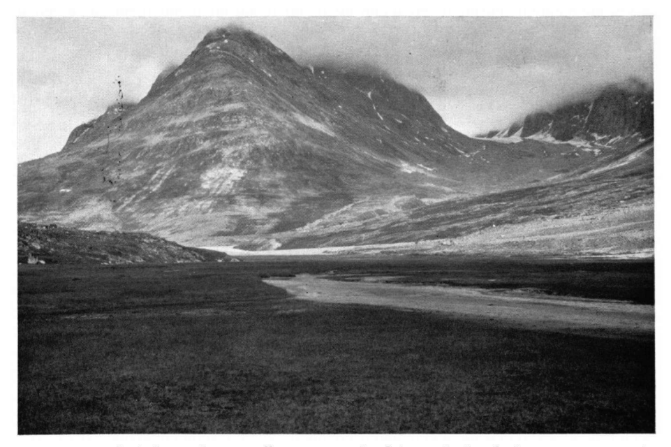
FIGURE 2. The habitat of Dicranella riparia on the delta at the head of Qingertivaq Fjord.

be described as northern amphi-atlantic (Fig. 1), and ranging from the boreal to the low-arctic zone.