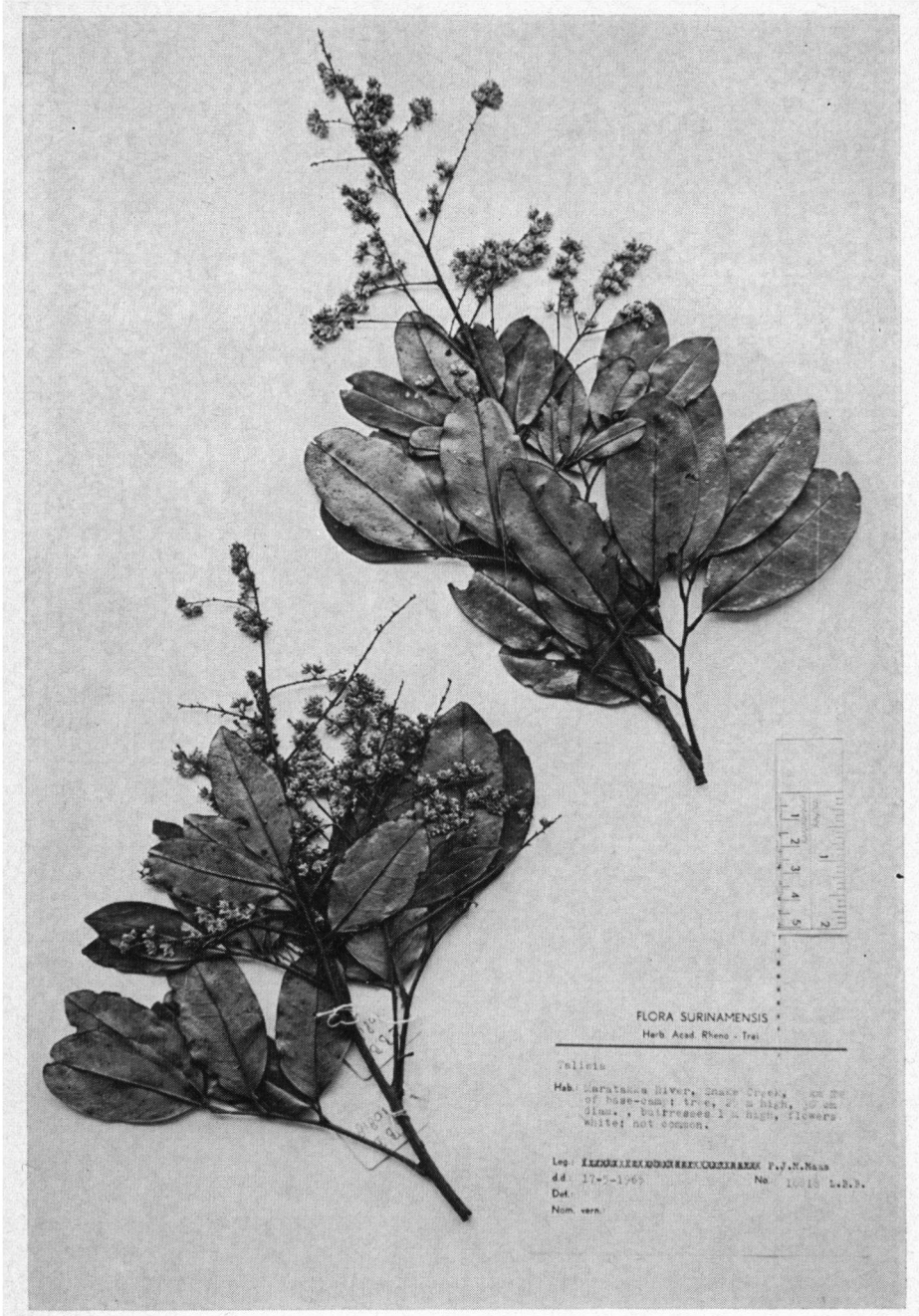
Plate 1. Type sheet of Talisia simaboides Kramer.