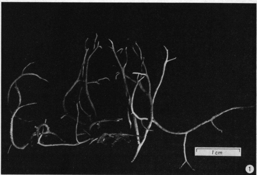
Fig. 1. (Huds.) Schrad. Plant with psoromic acid, from Penhas Douradas, Portugal, leg. Barendregt & v.d. Dries nr. 1 (U).

Morphologically the plants with psoromic acid represent the slender form of C. furcata , which is the predominant form in lowland western Europe (fig. 1). The podetia are c. 3 cm long and up to 0.8 mm wide, branching regularly