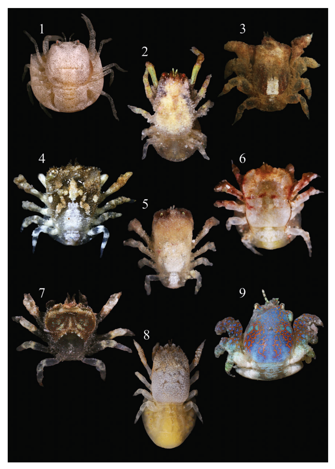
Fig. 1. The cryptochirid taxa used in this study: (1) Hapalocarcinus marsupialis ; (2) Utinomiella dimorpha ; (3) Opecarcinus lobifrons ; (4) Fungicola utinomi ; (5) Dacryomaia sp.; (6) Fungicola fagei ; (7) Fizesereneia sp.; (8) Lithoscaptus tri ; (9) Pseudocryptochirus viridis . No picture is available for Cryptochirus coralliodytes . Not to scale.