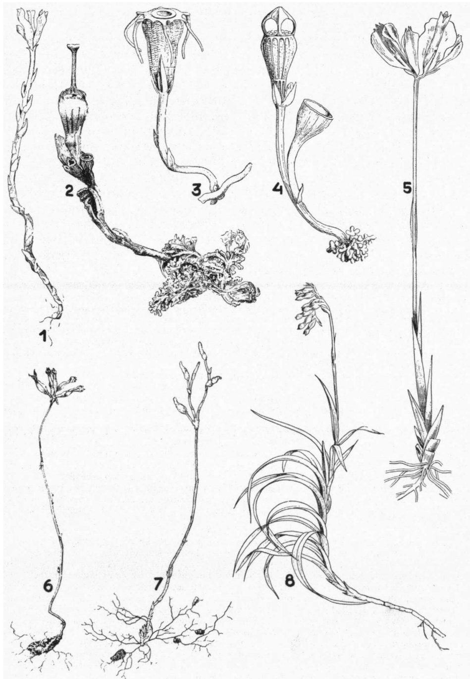
Fig. 1-8. Burmanniaceae. 1. Burmannia bifaria J. J. S., \times \frac{1}{11} , 2. Scaphiophora gigantea JONK., \times \frac{1}{13} , 3. Thismia aseroe BECC., \times \frac{8}{15} , 4. Th. episcopalis (BECC.) F. V. M., \times \frac{2}{13} , 5. Burmannia coelestis DON, \times \frac{3}{2} , 6. Burmannia championii THW., \times \frac{1}{11} , 7. Gymmosiphon aphyllus BL., \times \frac{2}{13} , 8. Burmannia longifolia BECC., \times \frac{2}{15} .