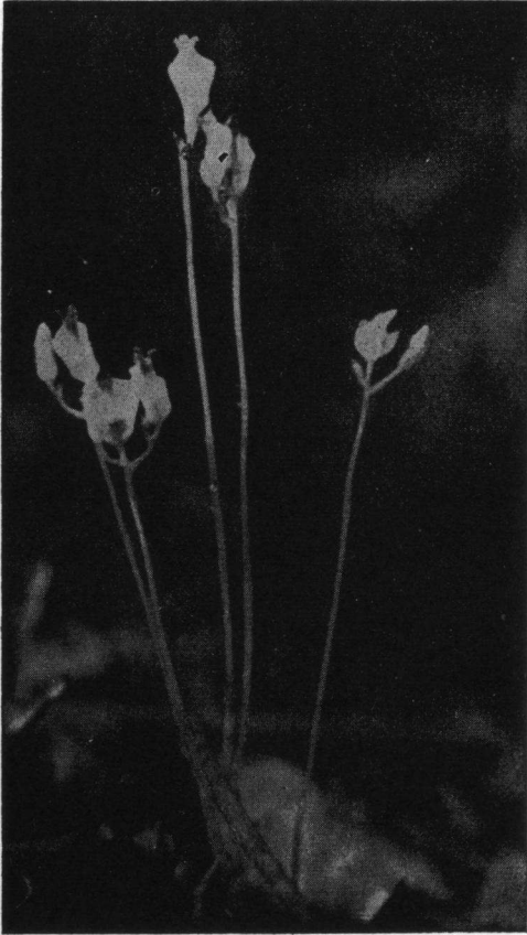
Fig. 9. Burmannia lutescens BECC., with broad wings (Mt Gedeh, W. Java), \times \frac{1}{1} .

point at the apex, usually directed inwards and then hardly perceptible. Style thick-filiform, bearing 3 subsessile funnel-shaped stigmas; style with stigmas 3 mm. Ovary ellipsoid to obovoid, 2–3 mm.