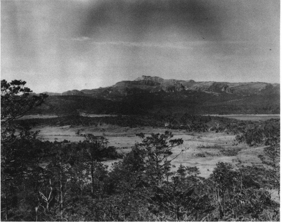
Fig. 88. View south over the Archbold Expedition camp and Lake Habbema to snow-capped Mt Wilhelmina, from an altitude of 3265 m. Open forest of Libocedrus papuana F.v.M. in foreground centre and big, moss-cushioned Podocarpus compacta ; alt. of Lake Habbema 3225 m, Mt Wilhelmina 4750 m.

Guinea 2 (1979) 2, f. 33. — Papuacedrus torricelensis (SCHLTR) LI, J. Arn. Arb. 34 (1953) 25; FLORIN & BOUTELJE, Acta Horti Berg. 17 (1954) 31, pl. 2, t. 4–6; HARRISON in Dallimore & Jackson, Handb. Conif. ed. 4 (1966) 323. — Fig. 88, 89.