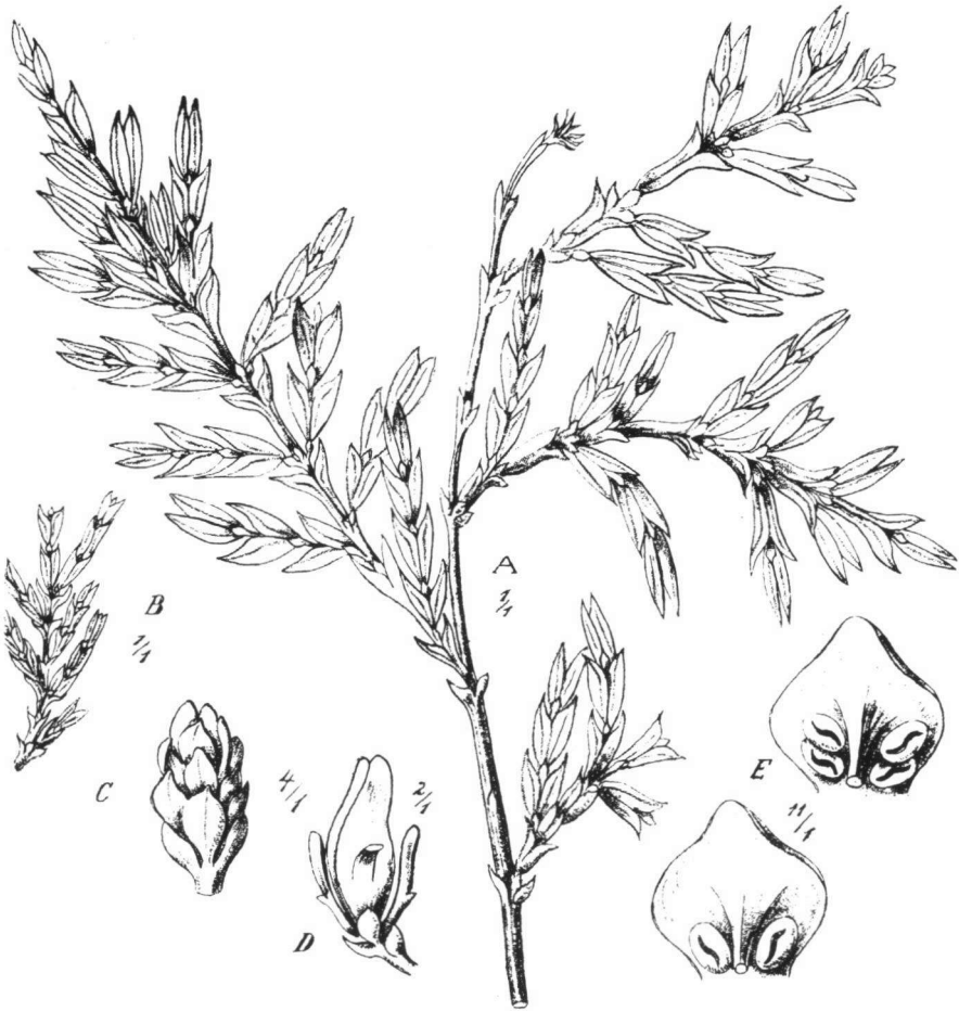
Fig. 89. Libocedrus papuana F.v.M. var. papuana . A. sterile twig; B. fertile twig; C. pollen cone; D. seed cone; E. scales with pollen sacs (from LAUT. Bot. Jahrb. 50, 1913, 52, f. 2).

falcately bent outwards but the tip always turned upwards, up to 13 mm from base to tip, gradually becoming smaller and less spreading as the tree matures.