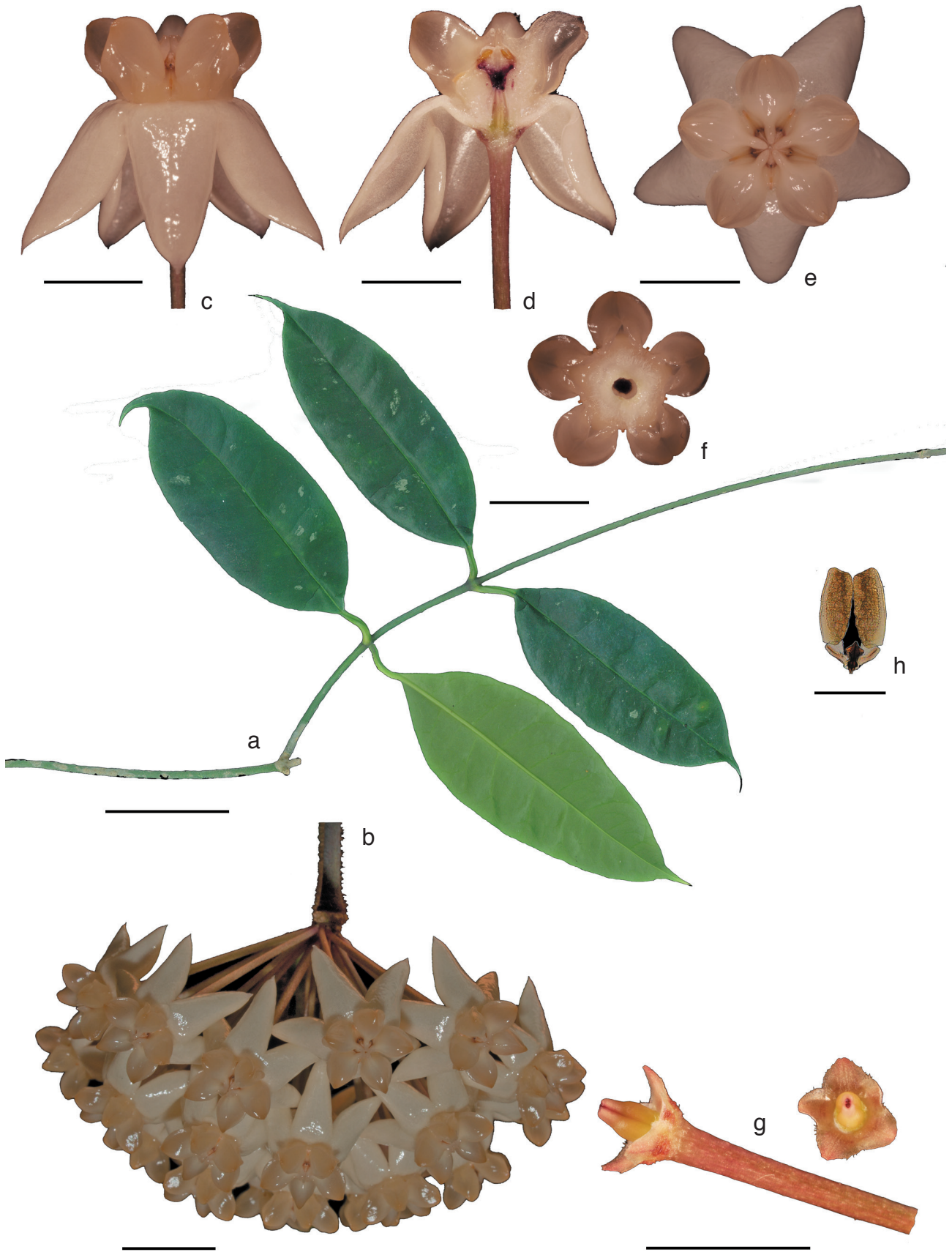
Fig. 1 Hoya thuatienhuensis T.B.Tran, Rodda & Simonsson. a. Sterile branch; b. inflorescence; c. flower, lateral; d. flower, longitudinal median section; e. flower, from above; f. corona, underside; g. pedicel, side and frontal view; h. pollinarium (all: holotype). — Scale bars: a = 5 cm; c–g = 5 mm; b = 1 cm; h = 0.5 mm.