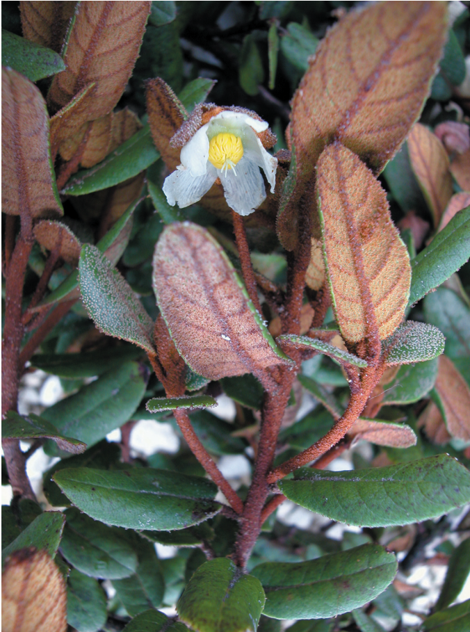
Fig. 4. Saurauia giluwensis (shown) often occurs with S. taylorii in mixed populations. The two species are the most common Saurauia in the Waile Creek area (Takeuchi, Towati & Ama 20259).

2. Although the novelty is apparently referable to section Pleianthae subsection Setosae , infrageneric separations are very problematic in this genus (Smith 1941) and are likely to be redefined by future revision.