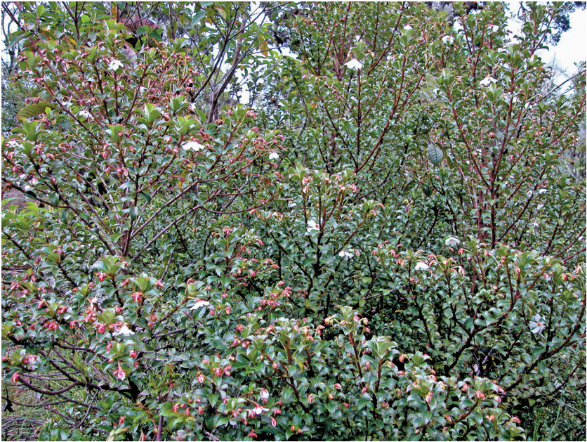
Fig. 2. Saurauia taylorii W.N.Takeuchi. In situ flowering aspect (Takeuchi, Towati & Ama 20310).