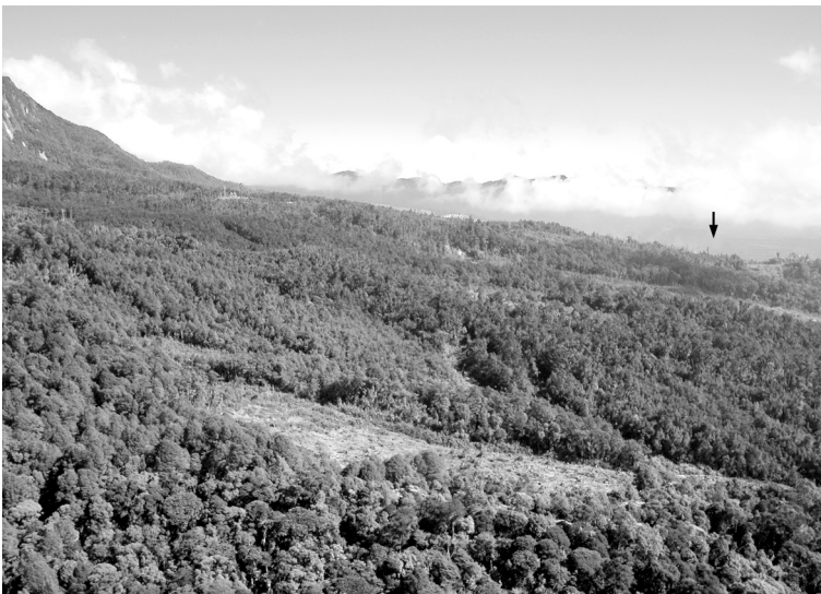
Fig. 1. Kaijende Highlands. Foreground: forest habitat for Saurauia taylorii . Background (arrow): the Porgera open pit, one of the world's premier gold mines.

The Kaijende Highlands is a locality of considerable resource significance to Papua New Guinea (PNG). As the socioeconomic centre for Enga Province, the district ironically includes some of the largest remaining tracts of upper montane forest in Papuasias. Its open-pit mine at Porgera is the world's sixth largest producer of gold (Fig. 1), averaging