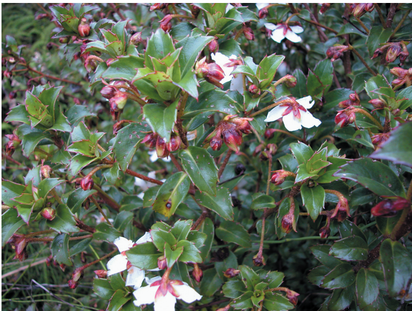
Fig. 3. Closer view of the flowering branches. The corolla is disproportionately large in relation to the unusually small (1.5–3 cm long) leaf-blades (Takeuchi, Towati & Ama 20310).