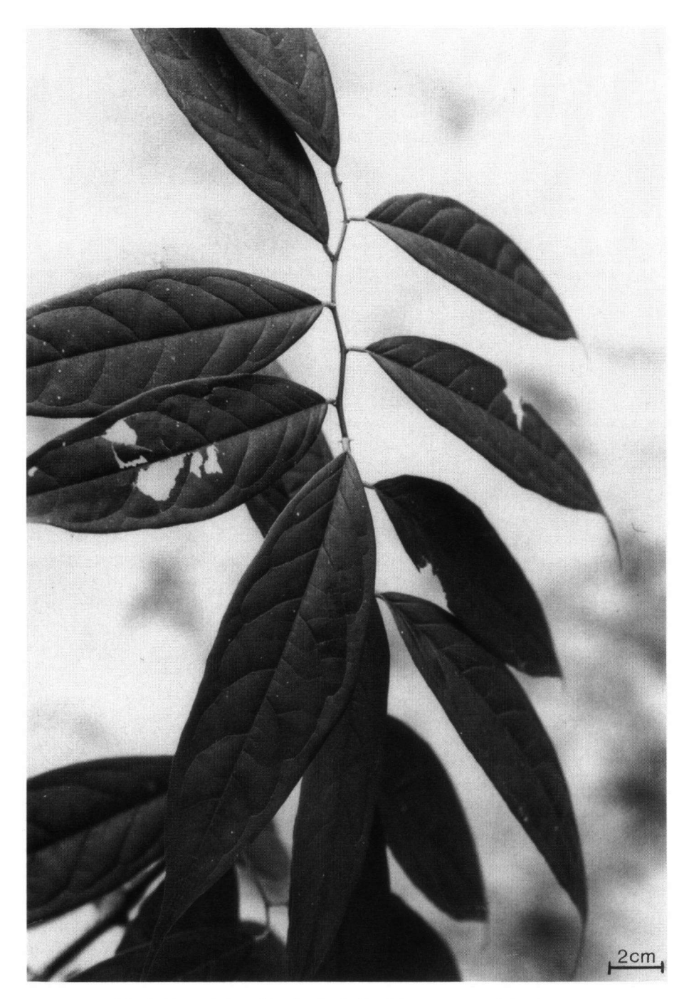
Fig. 1. Capparis buwaldae Jacobs, habit of the upper part of the plant.