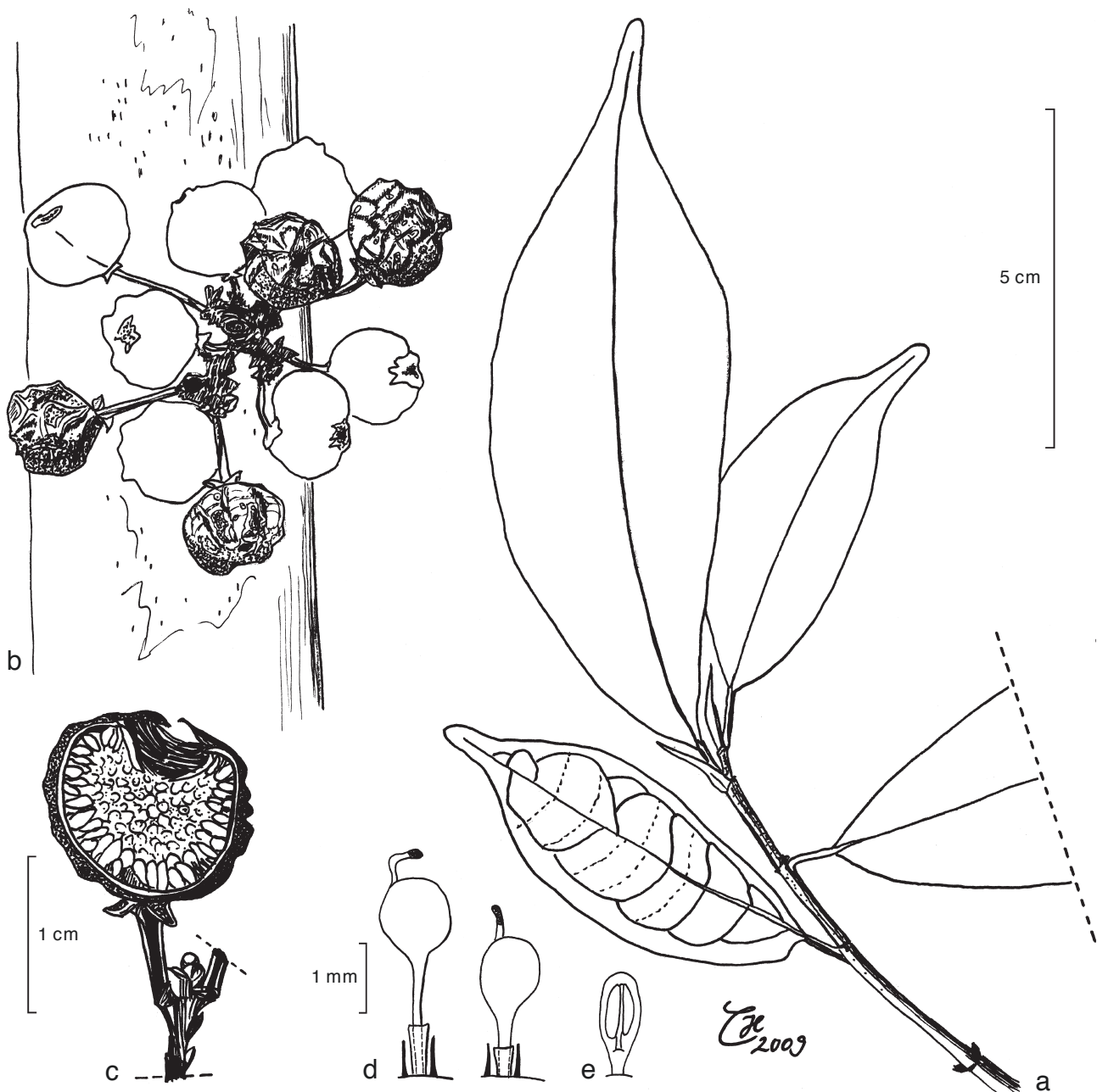
Fig. 1 Ficus schwarzii Koord. a. Leafy twig; b. branched fig-bearing branchlet with cluster of figs; c. fig receptacle in longitudinal section; d. long-styled pistillate flowers; e. staminate flower (a–d: Culmsee 3165; e: Sands 401).

spicuous (warty) lenticels below the (scars of the) stipules, with small abortive axillary buds, the scars of the leaves prominent; internodes hollow or solid; periderm persistent or flaking off. Leaves laxly spirally arranged to subdistichous to partly subopposite; lamina oblong to elliptic or to (sub)obovate, 3–15(–18) by (1–)2–5(–7) cm, (almost) symmetric, chartaceous to subcoriaceous, apex acuminate to subcaudate (or to obtuse), base equilateral to slightly inequilateral, cuneate to rounded, margin (sub)entire; upper surface sparsely whitish to brownish strigillose, mainly on the midrib (or glabrous), smooth, lower surface sparsely brownish to whitish strigillose on the main veins, smooth, cystoliths only beneath; lateral veins (4–)6–10 pairs, none of them furcate away from the margin, tertiary venation reticulate or towards the margin (sub)scalariform; waxy glands in the axils of some of the lateral veins in the middle part of the lamina; petiole 0.3–1.5(–3.5) cm long, sparsely brownish to whitish strigillose, the epidermis flaking off; stipules 0.5–1.8 cm long, subglabrous or strigillose mainly on the keel, caducous or (sub)persistent (when juvenile). Figs on (the lower part of)