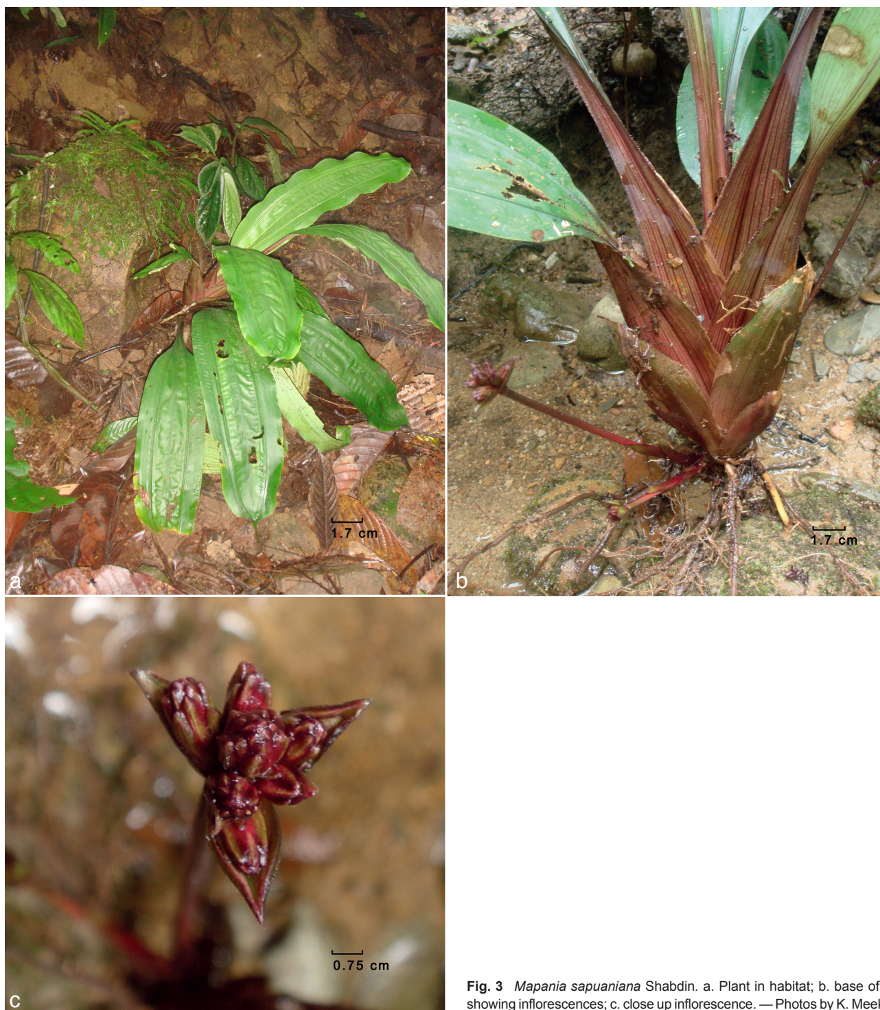
Fig. 3 Mapania sapuaniana Shabdin. a. Plant in habitat; b. base of plant showing inflorescences; c. close up inflorescence.

therefore describe this species based on the morphological / taxonomic species concept (Cronquist 1978).