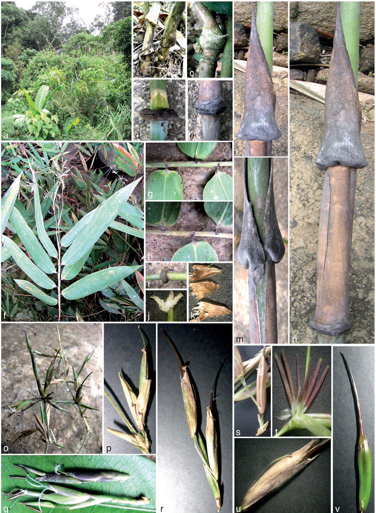
Fig. 2 Cochinchinochloa braiana H.N.Nguyen & V.T.Tran. a. Habitat; b. rhizome with short necks; c. branches with middle one dominant; d. internode with thick swollen patella and bud; e. base of culm leaf; f. leafy flowering branch; g. section of leafy branch with under leaves surface; h. section of leafy branch with upper leaves surface; i. section of internode of leafy branch with thick swollen patella; j. stigmas; k. lodicules; l. ventral view of culm leaf with auricles; m. dorsal view of culm leaf; n. culm leaf; o, p. section of flowering branches; q, r. pseudospikelets with two florets; s. 2-keeled, grooved palea; t. lodicules and stamens; u. floret; v. caryopsis. — Photos by Tran Van Tien from the type locality.