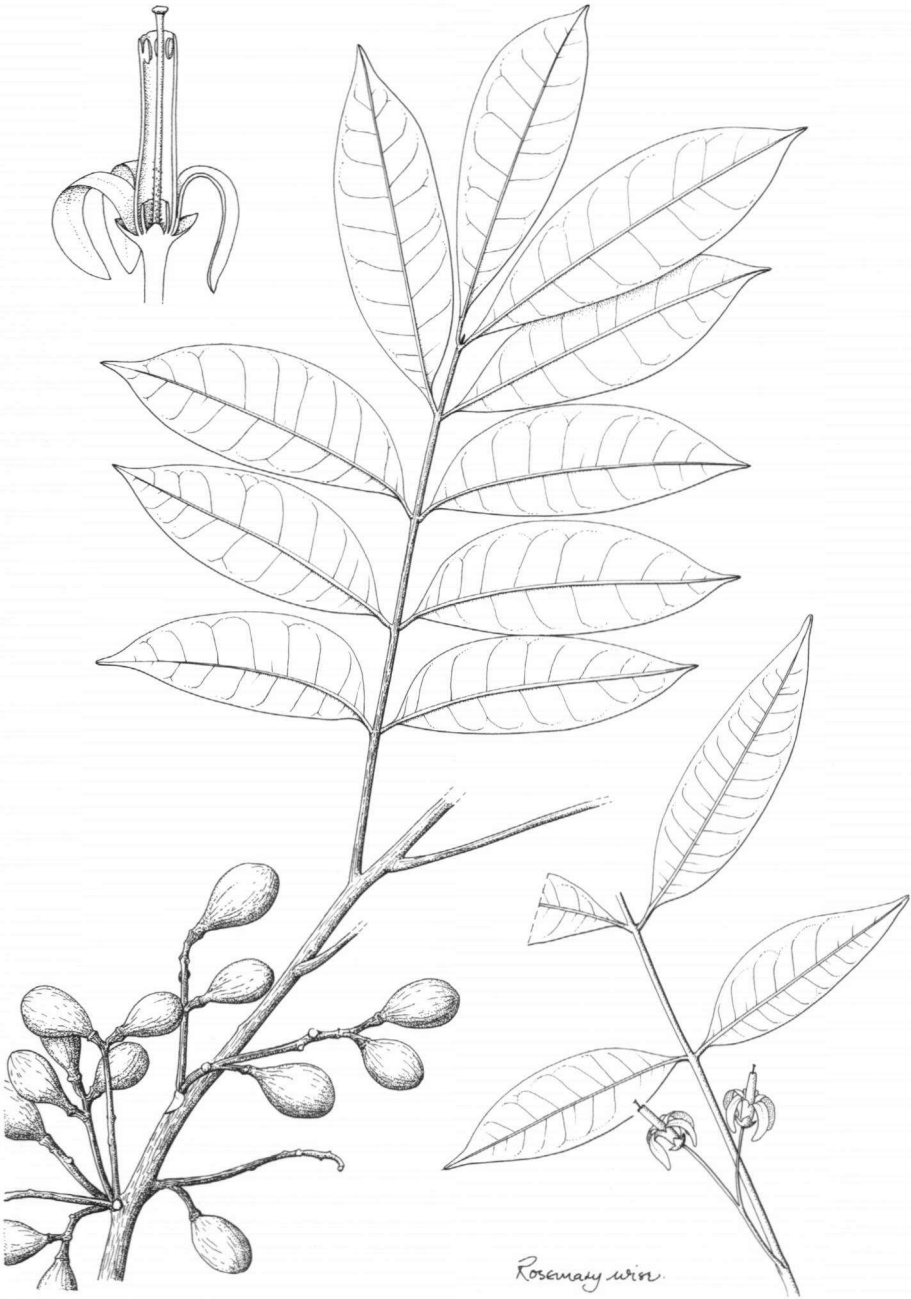
Fig. 2. Dysoxylum boridianum Mabb. Flowering shoot ( \times 0.5 ) and half-flower ( \times 2 ) (Carr 14913); fruiting shoot ( \times 0.5 ) (Carr 14270).