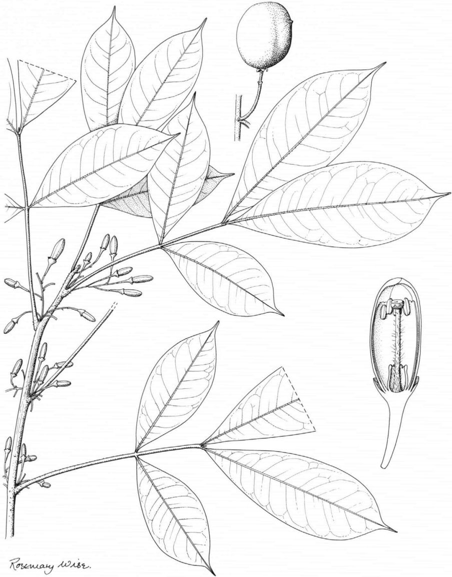
Fig. 6. Dysoxylum sparsiflorum Mabb. Flowering shoot ( \times 0.5 ) and half-flower ( \times 2.5 ) (Hoogland & Craven 10601, type); fruit ( \times 0.5 ) (Aet [Lundquist] 494).