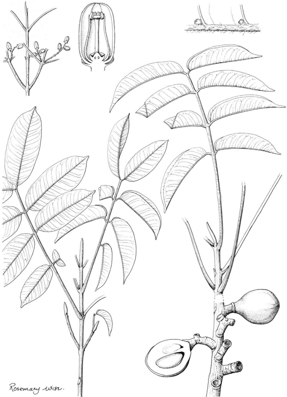
Fig. 3. Dysoxylum carolinae Mabb. Inflorescence ( \times 0.5 ) and half-flower ( \times 4 ) (FD 49827, type); vegetative shoot ( \times 0.5 ) (Mabberley & Pannell 1989); infructescence ( \times 0.5 ) (Brillet 14); leaf abaxial surface ( \times 5 ) (SAN 40680).