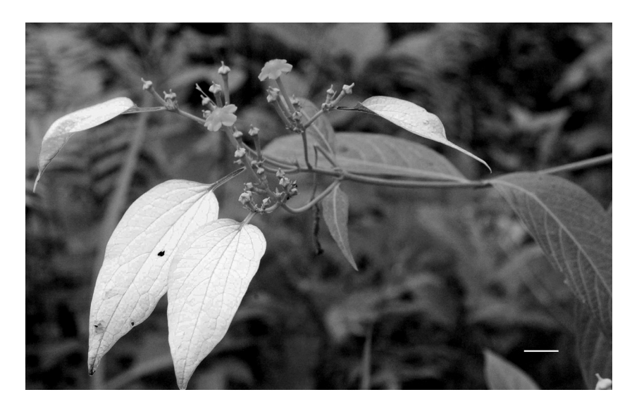
Fig. 1. Photograph of Schizomussaenda henryi (Hutch.) X.F.Deng & D.X.Zhang, showing scorpioidcymose inflorescence ( X.F. Deng & H. Ren 442 , IBSC). Scale = 2 cm.

Field studies were carried out at Xishuangbanna Tropical Botanical Garden and along Xiaola Highway, Mengla County, Yunnan Province (China) in 2005 and 2006. We sampled three populations of Schizomussaenda dehiscens , one population at Xishuangbanna Tropical Botanical Garden (voucher: X.F. Deng & H. Ren 400 ) and the others both along Xiaola Highway in Xishuangbanna (voucher: X.F. Deng & H. Ren 442 , X.F. Deng & L. Gu 513 ). Ten individuals per population were randomly collected to observe and measure plant size, leaf size and shape, petaloid calyx-lobe size and shape, corolla-tube length, style and stigma length, and stamen height.