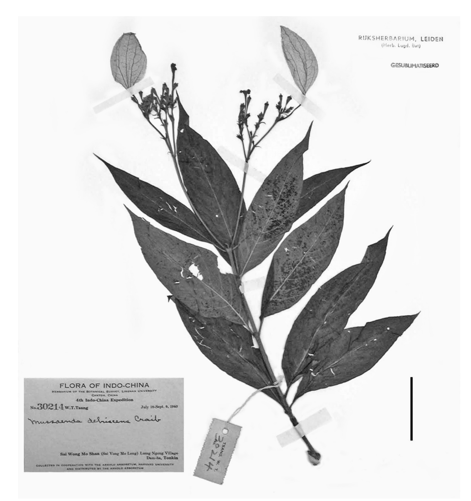
Fig. 4. Photograph of a specimen identified as Schizomussaenda dehiscens (Craib) H.L.Li. ( W.T. Tsang 30214 , L). Scale = 4 cm.

characters but the shape and size of the leaves and petaloid calyx-lobes. The leaves of Mussaenda henryi are elliptic or narrowly elliptic with rounded base, up to 10–15 by 4-6 cm and the white petaloid calyx-lobes are ovate with rounded base, up to 7–10 by 4.5-7 cm (with petiole 2-2.5 cm long), whereas in M. elongata , the leaves are narrowly elliptic with attenuate base, up to 18-24 by 5-7 cm and the white petaloid calyx-lobes are narrowly ovate with attenuate base, up to 8-12 by 4-5 cm (with petiole 3-3.5 cm long). But according to our field studies mentioned above, the difference between M. henryi and M. elongata , and between each of them to Schizomussaenda dehiscens , falls well within the range of variation of S. dehiscens within a single population. Although all two type specimens lacked fruits, the elongated scorpioid-cymose inflo-