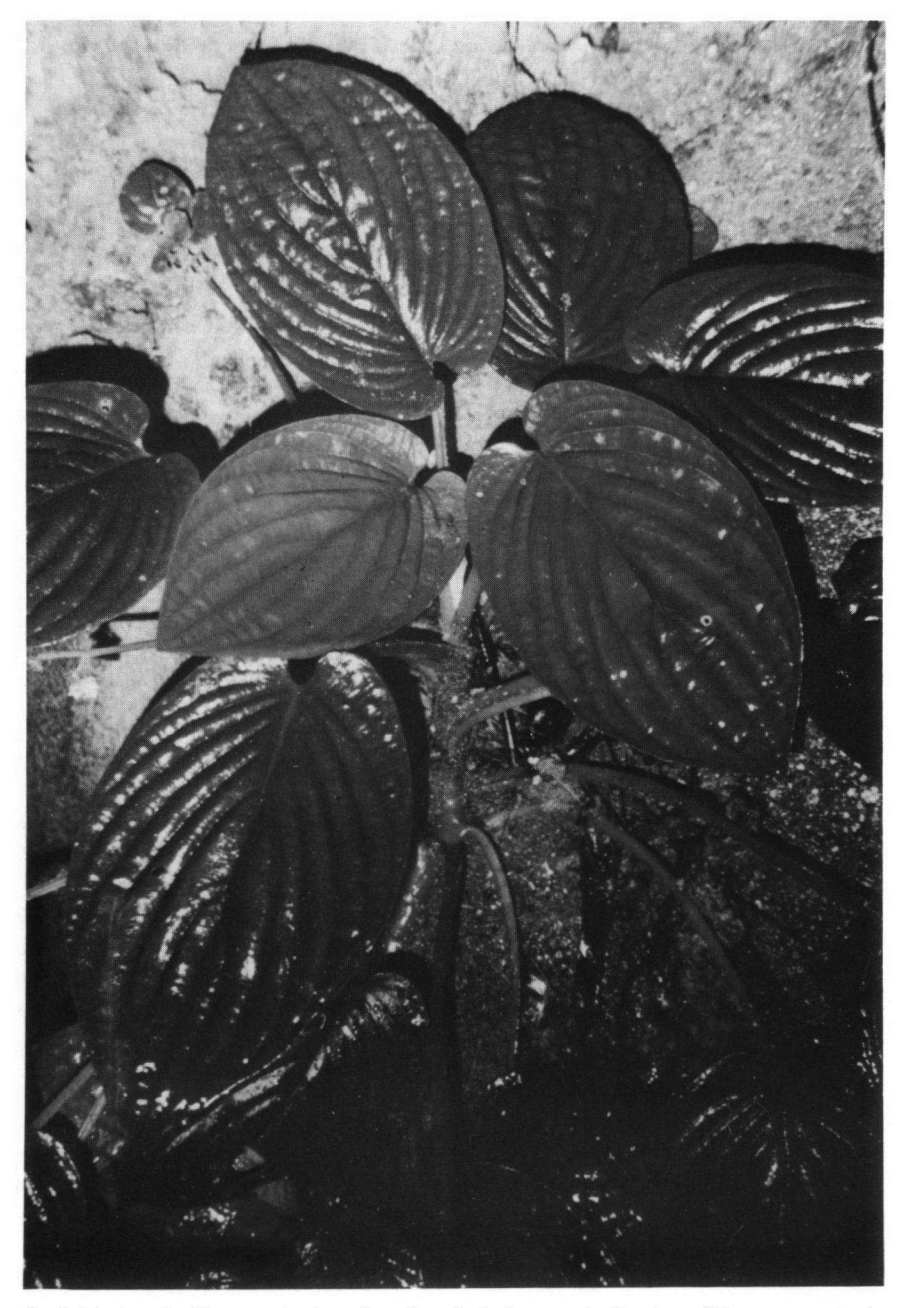
Fig. 1. Black-and-white reproduction of a colour-flash photograph of a plant of P. sumatrana in situ, growing on a very shady rock block (same population as de Wilde & de Wilde-Duyfjes 21399 ); \times 0.3 . Note small viviparous plantlet at top of inflorescence in upper left corner.