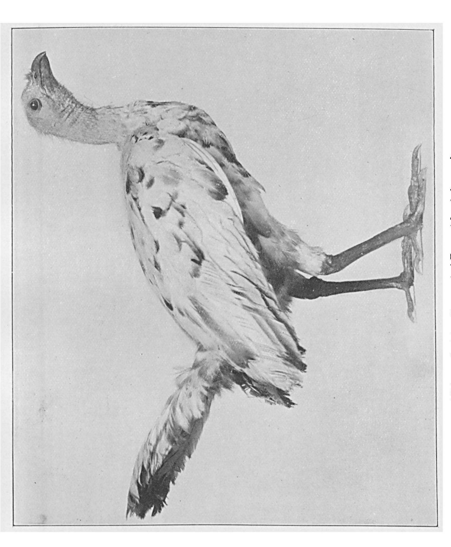
Albino of Talegallus cuvieri Less. (about 4 n. s).