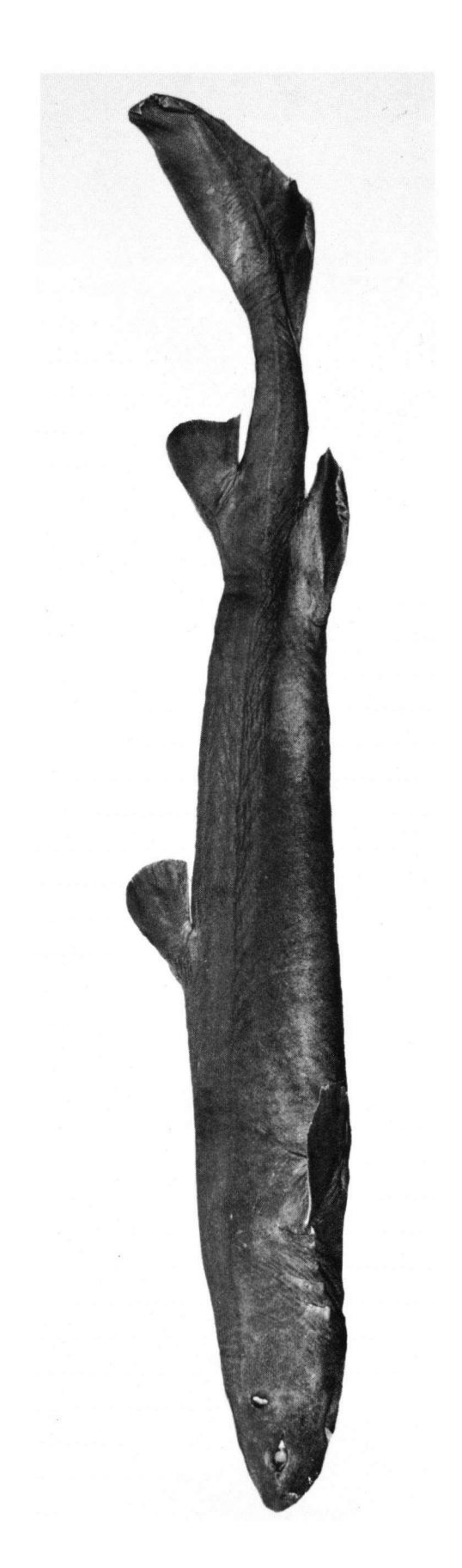
Fig. 1. Dalatias licha, a female of 170 cm total length, caught alive off LJmuiden on 16-XII-1975 (ZMA 114.067).