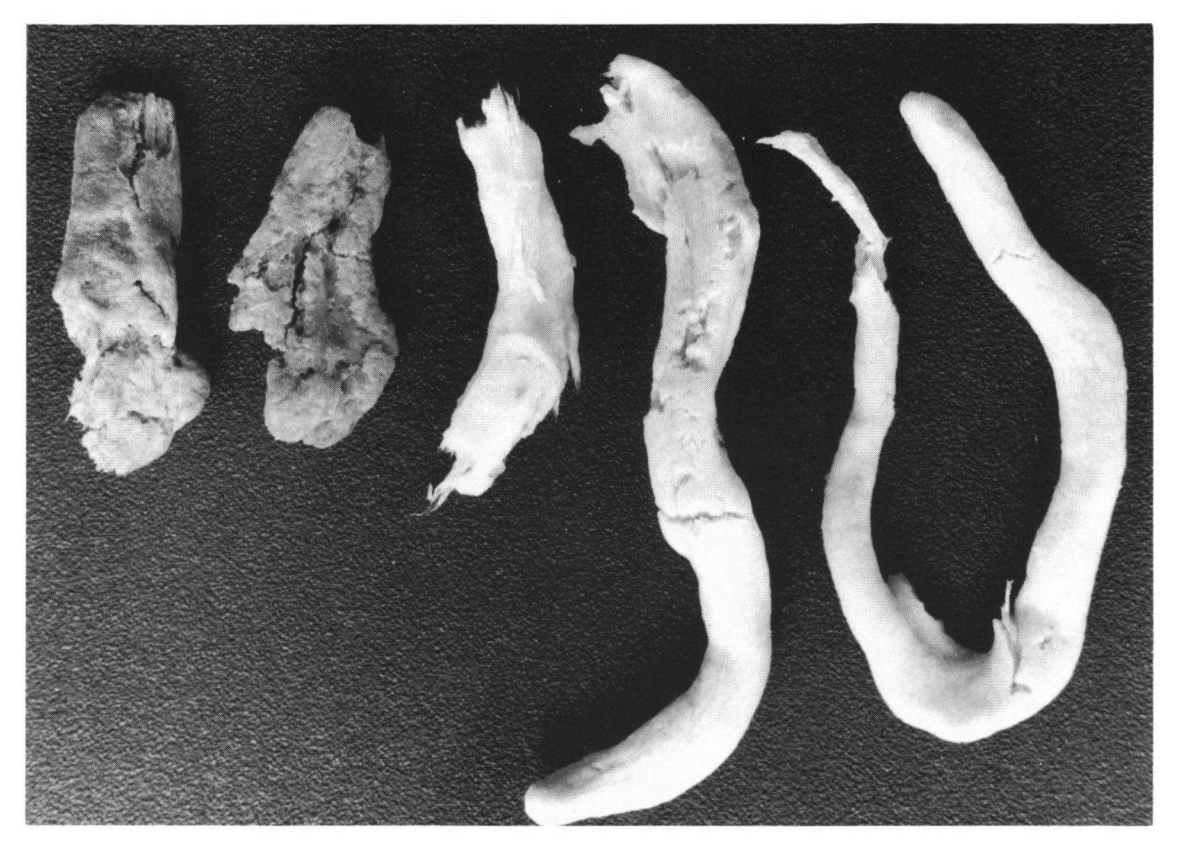
Fig.1. Suberites massa Nardo, long-branched fragments from the Aegean Sea (natural size).

to this species (cf. Topsent, 1900), from clavate with apical oscule, through thickly and thinly ramose, to massively encrusting-lobose. These growth forms are not readily recognizable in the original area from which the species was described (i.e. the British Isles), where only the clavate (sometimes doubly clavate) growth form is found (see Hiscock et al., 1984; Ackers et al., 1988). The clavate form (fo. typica sensu Topsent) is found throughout the Mediterranean and also occurs in the Aegean Sea. Thinly ramose growth forms (fo. ramosa sensu Topsent) have been recently reassigned to a separate species, Suberites syringella (Schmidt) (see below), while lobate forms (fo. flava sensu Topsent) are assignable to Suberites massa Nardo. Thinly encrusting growth forms (fo. incrustans sensu Topsent) are difficult to distinguish from Prosuberites epiphytum, and may be the initial stages of one of the mentioned species.