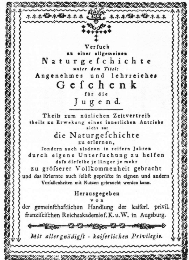
Fig. 2 (left), the title-page, and fig. 3 (right), the paper cover of volume I.

men / und lehrreichen / Geschenkes / für die / Jugend, / oder / weitere Versuche / zu / einem allgemeinen nicht nur / Les — sondern auch sichtbaren / general Register aus der / Naturgeschichte. / Herausgegeben . . . . / Auf die Leipziger Ostermesse / 1788. (title-page, fig. 6). The half-title gives additional information about the number of plates. The half-title reads: Zweite Fortsetzung / . . . . / Jugend, / mit 28 neuen Tabellen / worauf 789 Fische, nämlich 430 rayische 271 / blochische und 88 chinesishe in 332 Feldern, deren / allezeit 16 auf einer Tabelle befindlich sind, vorge- / stellet werden.