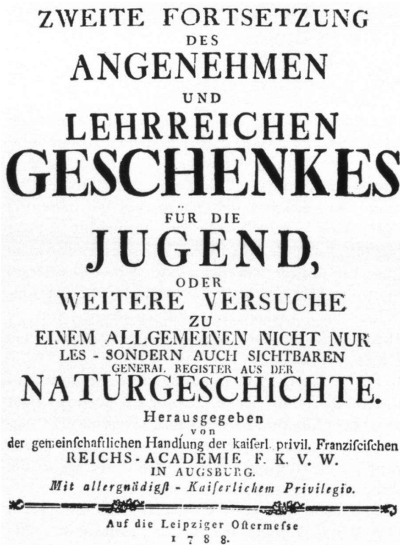
Fig. 6. The title-page of volume III; paper cover and title-page are identical.

As an addendum to the plates on fish, the publisher of the “Geschenk” printed a copy en-