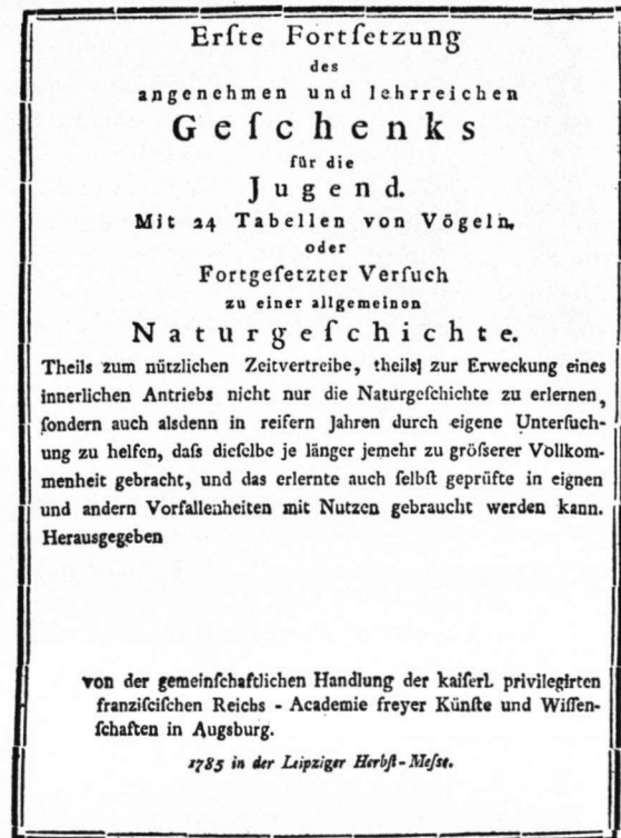
Fig. 4 (left), the title-page, and fig. 5 (right), the paper cover of volume II.

plates on amphibians and reptiles. "In complete volumes bought by the publisher in Augsburg or at the Leipzig Fair this index was already incorporated", as he stated. It is not certain whether this index is the same index in four languages mentioned on the first plate of the third volume.