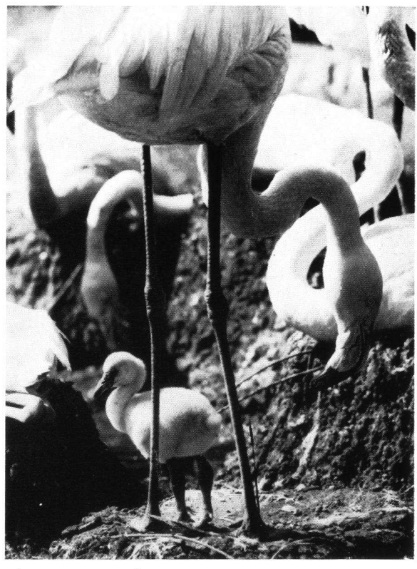
Phoenicopterus ruber roseus. Junges ein Woche alt.