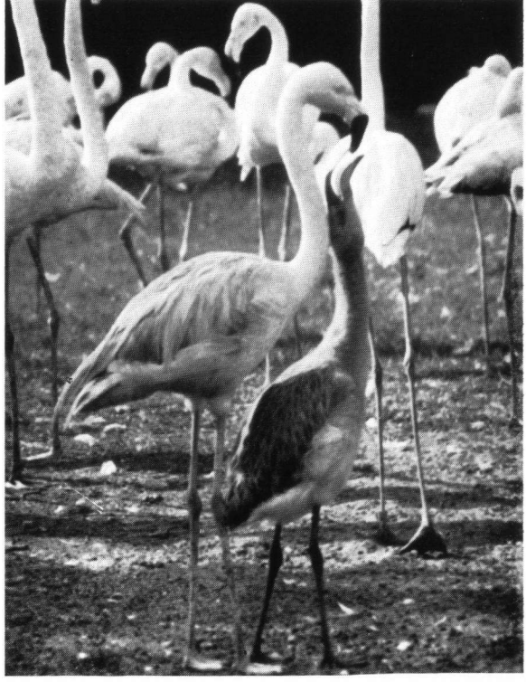
Phoenicopterus ruber chilensis. Männchen füttert zehn Wochen altes Junges.