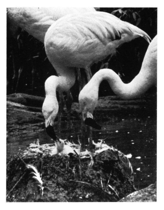
Phoenicopterus ruber chilensis. Junges zwei Tage alt. Eltern füttern.