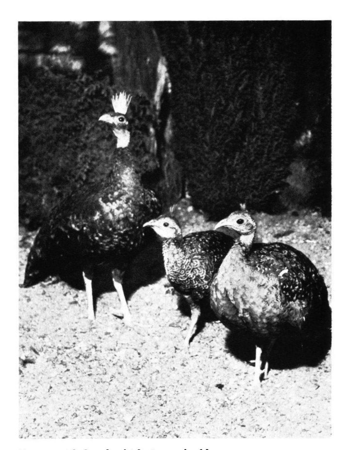
Parents with female chick, 6 month old.