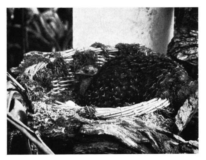
Female on nest. Day of hatching. Part of one of the eggs visible.