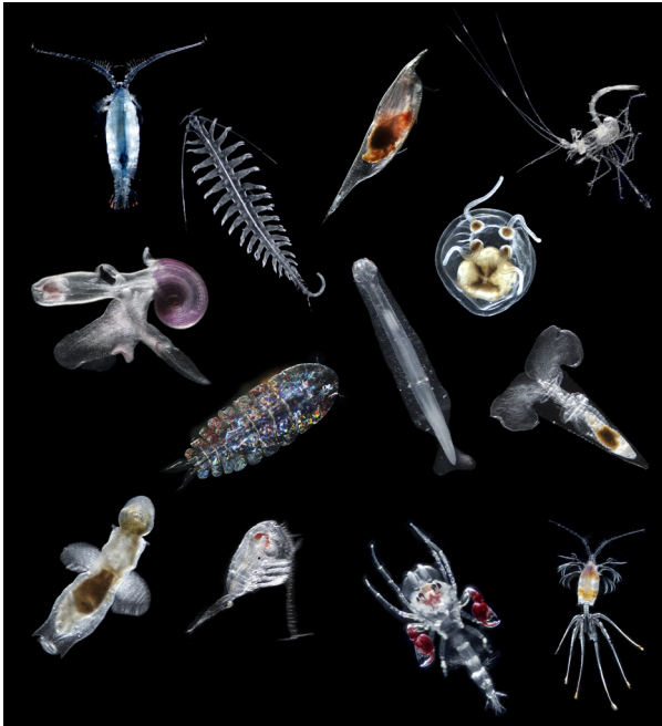
Figure 1. Examples of the diverse holozooplankton assemblage of the Atlantic ocean (members of the phyla Arthropoda, Mollusca, Annelida, Cnidaria, and Chaetognatha are represented). Photographed by the authors during the Atlantic Meridional Transect (AMT22) research cruise in October–November 2012.

2008; Ji et al. 2010). Here, we consider evolutionary responses, that is, those that result in genetic changes in a population, for example, in response to selective pressure. Although the number of studies that have rigorously tested for genetic adaptation in marine zooplankton is small, and limited to estuarine and coastal taxa that are amenable to laboratory experimentation (reviewed in Dam 2013), unequivocal evidence exists for genetic adaptation in marine zooplankton. One example is that grazer populations with a history of exposure to toxic algal blooms have significantly higher fitness when challenged with toxic prey than those with little or no such history of exposure (Colin and Dam 2007). There is also an extensive literature providing evidence for adaptive evolution in freshwater zooplankton, for example, using the water flea Daphnia as a model system (e.g., Critescu et al. 2012; Orsini et al. 2012). Our review focuses on the open ocean zooplankton, the majority of which cannot be cultured in the laboratory. We argue that evolutionary responses to global change are important to consider for these taxa, and explore indirect methods for studying evolution in these oceanic species.