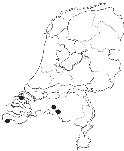
Figure 3. Distribution of Atomaria scutellaris in the Netherlands. Figuur 3. Verspreiding van Atomaria scutellaris in Nederland.