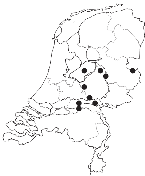
Figure 2. Distribution of Cryptophagus dorsalis in the Netherlands. Small dots = only records prior to 1900. Figuur 2. Verspreiding van Cryptophagus dorsalis in Nederland. Kleine stippen = slechts waarnemingen van vóór 1900.