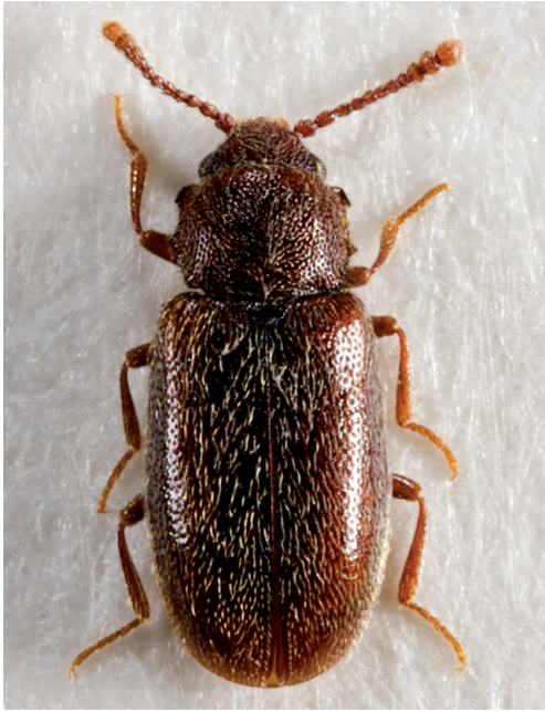
Figure 1. Cryptophagus dorsalis , 1.v.2003, Ophemert.