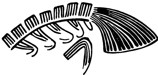
Fig. 1. Stylized figure of a spiny lobster, found as an ornament on the head of an Easter Island wooden figure. From Métraux (1957, fig. 26) after Lehmann (1907).

Remarks. — The specimen collected by the 1964-1965 expedition agrees very well with the other material and with the description and figures given by George & Holthuis (1965). None of the abdominal grooves is interrupted in this specimen. The anterior dorsal part of the body bears many small