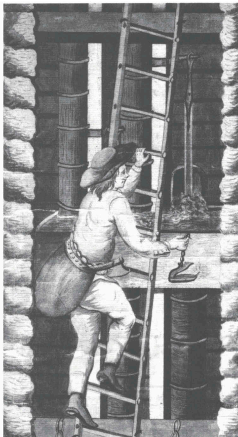
Fig. 2. Mining worker by the water column machine in the shaft. Detail from the mining map dating back to the 2nd half of the 18th century.

The mention of the model of a wind smelting furnace dates back to 1653. Daniel David Mossmann was paid 12 Reichstalers for it. Three models of Štiavnica's mines cost 1039 florins and