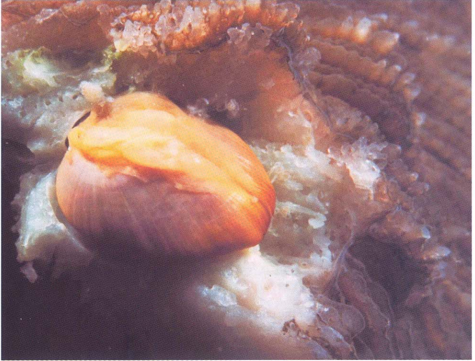
Fig. 1. Fungiacava eilatensis in Sandalolitha dentata (Kudingareng Keke I, RMNH 84612).

At South Sulawesi, most of the endoparasitic bivalves were found at lower reef slopes and reef bases, especially in specimens of Fungia fragilis , F. costulata and F. moluccensis on sandy bottoms. Among these host corals, individuals of F. moluccensis appeared the most frequently infested. Corals of Sandalolitha and Podabacia , which become large in adult stage, usually contained the largest numbers of the mytilid parasite, particularly Podabacia species with over 10 bivalves per coral. With regard to habitat preference of F. eilatensis , there is no clear preference in distance offshore (table 1, fig. 3), since the animals were found on reefs near river mouths (2 km offshore) and on barrier reefs that are most remote from the river outlets (36 km offshore).