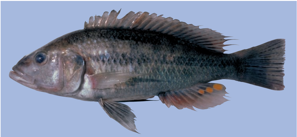
Fig. 10. Haplochromis vonlinnei spec. nov. Holotype, RMNH 83843, a ripening male, 159.0 mm SL.