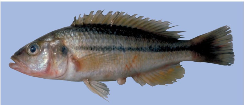
Fig. 11. Haplochromis vonlinnei spec. nov., RMNH 83845, a maturing female, 115.1 mm SL.