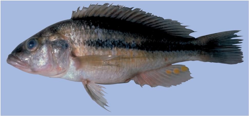
Fig. 9. Haplochromis vonlinnei spec. nov. RMNH 83844, a quiescent male, 143.2 mm SL.