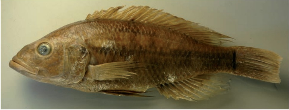
Fig. 1. Haplochromis vonlinnei spec. nov. Holotype, RMNH 83843, ♂, 159.0 mm SL.

Resembling species.— Amongst the described macrognathic haplochromine species of Lake Victoria with strongly curved oral teeth (see van Oijen, 1991) the only one that compares to H. vonlinnei in body shape is H. pyrrhopteryx van Oijen, 1991. However, the live and preserved colouration of this species differs markedly. Among other things, both sexes of H. pyrrhopteryx have a black chest belly and ventral side whereas a mid-lateral band is missing. Another species that has a comparable body shape, H. altigenis Regan, 1922, differs by a more prominent premaxillary pedicel, a relatively much deeper cheek and less strongly curved oral teeth. Live colours of this species are unknown (Greenwood, 1967).