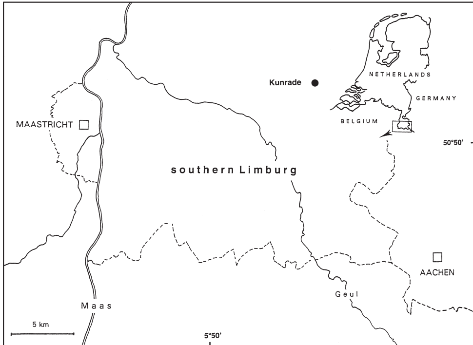
Fig. 1. Map of the type area of the Maastrichtian, showing the locality (Kunrade) where Brachyphyllum sp. 1 and Brachyphyllum sp. 2 were collected.