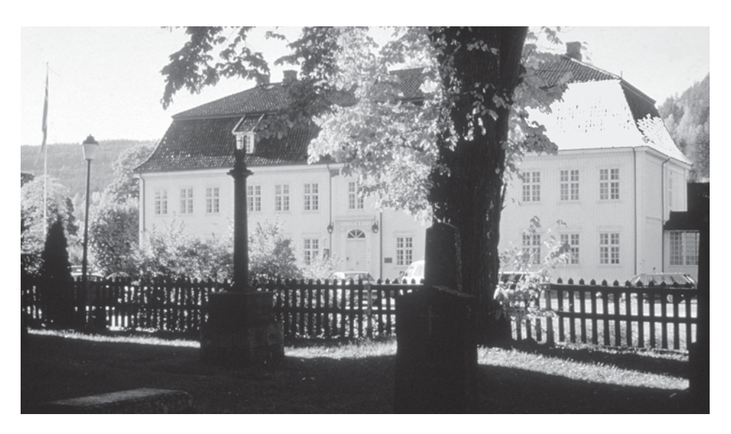
Fig. 4. The main building of the Mining Academy in Kongsberg, built 1786.

Czechia, Slovakia, Austria, Hungary, Rumania, Poland and Silesia (Esmark, 2003). He had long stays in Freiberg, as he was a great admirer of Abraham Gottlob Werner. All the three men wrote travel reports.