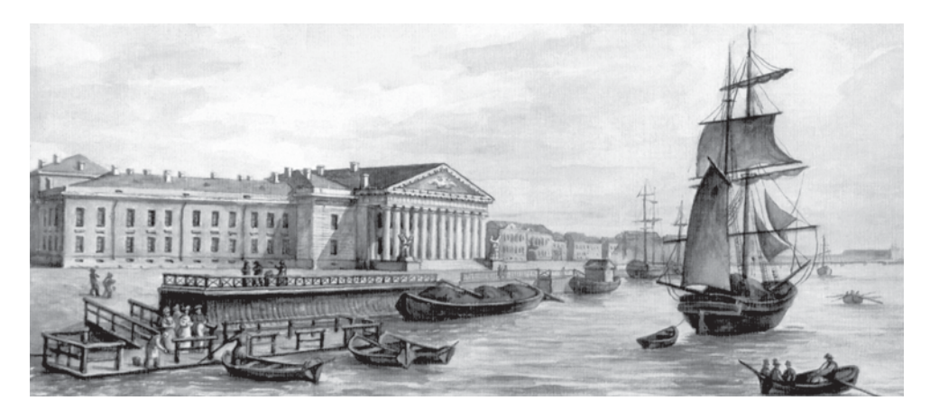
Fig. 4. The Mining Military School (postcard of Mining Institute St. Petersburg).

consists of five sections: salts, stones, metals, combustible minerals and rocks. Samples of the collection represent more than 100 Russian sites, among which deposits of the principal mining regions of Russia prevail, the Urals, Altai and Transbaikalian. The second, most numerous group of samples in the collection refers to "stones". These are basically coloured and ornamental stones, and rock-forming minerals, varieties of quartz, nephrite, garnet, beryl, topaz, tourmaline, lazurite, vesuviane, staurolite, feldspar, amphibole, pyroxene, and mica.