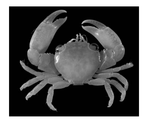
Fig. 2. Trapezia garthi Galil, 1983. Male (cl 4.3 mm, cw 5.1 mm; RMNH D 47800), Ambon, Indonesia, sta. RBE.27, Rumphius Biohistorical Expedition, 1990.

Sakai (1976: 509) considered his Trapezia sp. as "probably identical to T. areolata ," a common synonym for T. septata . In T. septata , however, thin, red-brown lines are interconnected in a honeycomb-like pattern on a pink to light-orange background (see below). The anterolateral margins of the authentic T. areolata Dana, 1852, however, are conspicuously