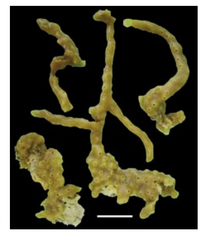
Fig. 1B. Callyspongia (Euplacella) biru spec. nov. Preserved specimen (ZMA POR. 15222). (scale bar = 5 cm).