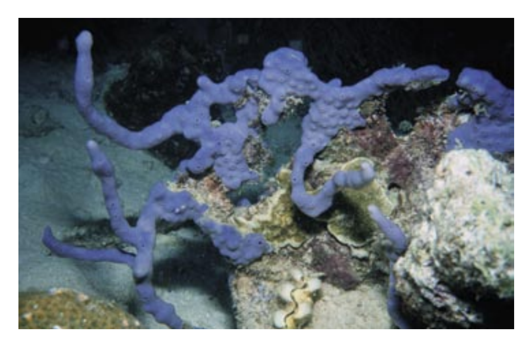
Fig. 1A. Callyspongia (Euplacella) biru spec. nov. In situ photograph of holotype (ZMA POR. 15222).