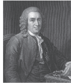
Fig. 2. Carl von Linné (1707-1778).

For most of the species listed in these books, Linné also indicated the sources on which he based his descriptions. For example, his Loxia caerulea scientifically described in 1758 was entirely based on plate 39 published by Catesby in 1731 (cf. example 1).