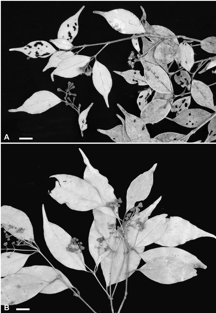
Fig. 1. A. Syzygium fratris Craven, flowering branchlets; B. Syzygium monimioides Craven, flowering branchlets (A: Craven, Jensen & Cooper 10421 (CANB); B: Forster, Sankowsky & Tucker 10750 (QRS)). — Scale bars = 1 cm.

long. Sepals 4, uniform in size or nearly so, transversely semicircular or transversely narrowly semi-elliptic, persistent, not accrescent, 0.1–0.5 mm long. Petals 4, deciduous, not coherent, 2 by 2–2.5 mm, margin entire or lacerate. Staminal disc unmodified or prominent. Stamens all fertile, outermost stamens 2–4 mm long; anther sacs parallel; anthers oblong, 0.3–0.5 mm long, dehiscing by longitudinal slits, connective not glandular. Style 4–6.5 mm long at anthesis. Placentation axile-median, the placenta